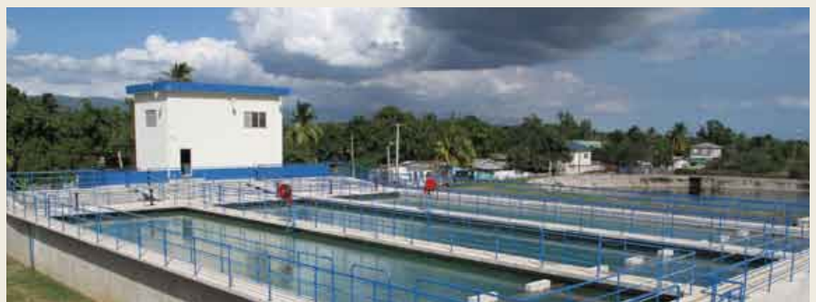
The Spanish Town Water Treatment Plant completed in August 2008 through the provision of ODA Loan

countries and fulfilling its role to provide aid for the resolution of global issues. On the country's water issues, ODA loan totaling ¥6.64 billion was approved for the "Kingston Metropolitan Area Water Supply Project" in 1996, which is now being implemented for the development of water resources as well as the restoration and expansion of water supply facilities, and thus to eliminate serious water shortages. This is one of the invaluable practices that reflect the synergy benefits gained between Technical Cooperation and ODA loan.