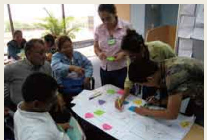
A scene from a training session. Participants create charts regarding zone risks.

For its part, JICA dispatches specialists who are experts in such fields as social protection, youth crime, social psychology and policy system support. We provide aid to minimize risks against the young and women, typical targets of crime, as well as their families and local communities.