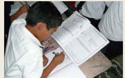
Students learn from textbooks developed during the project.

use. JICA was requested for repeated support by the country's government because of the striking improvement in children's grades, and from April 2006 for a period of three years JICA started a program with the goals of producing 4th–6th grade mathematics textbooks as well as realizing human resource development in the Ministry of Education of Guatemala. As was the case in Honduras, Japanese-style mathematics education is taking root in Guatemala.