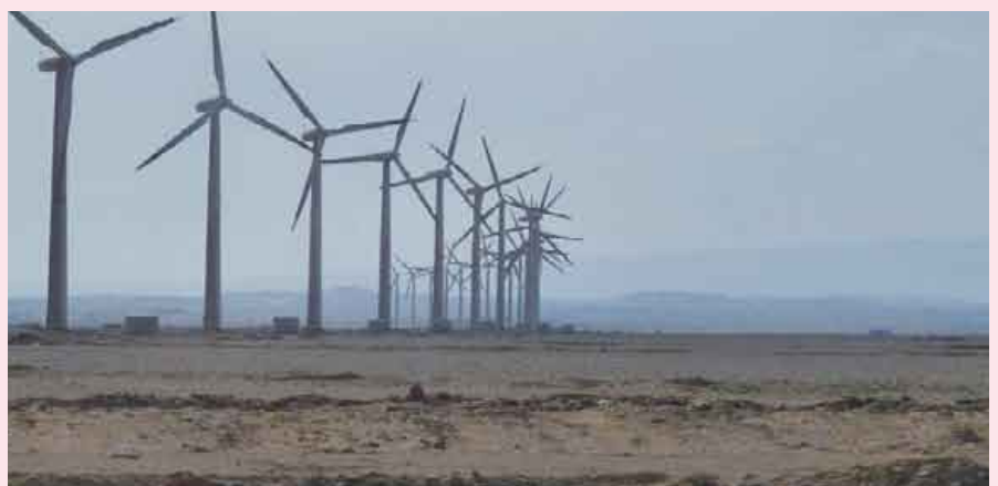
The Zafarana wind power plant, expected to combine electrical power supply with environmental conservation

Situated 220 kilometers southeast of the capital city of Cairo, the project is constructing a new 120 MW wind power plant in the Zafarana district along the Red Sea, which offers stable wind speed and direction. The use of wind power supports both the securing of needed power supply