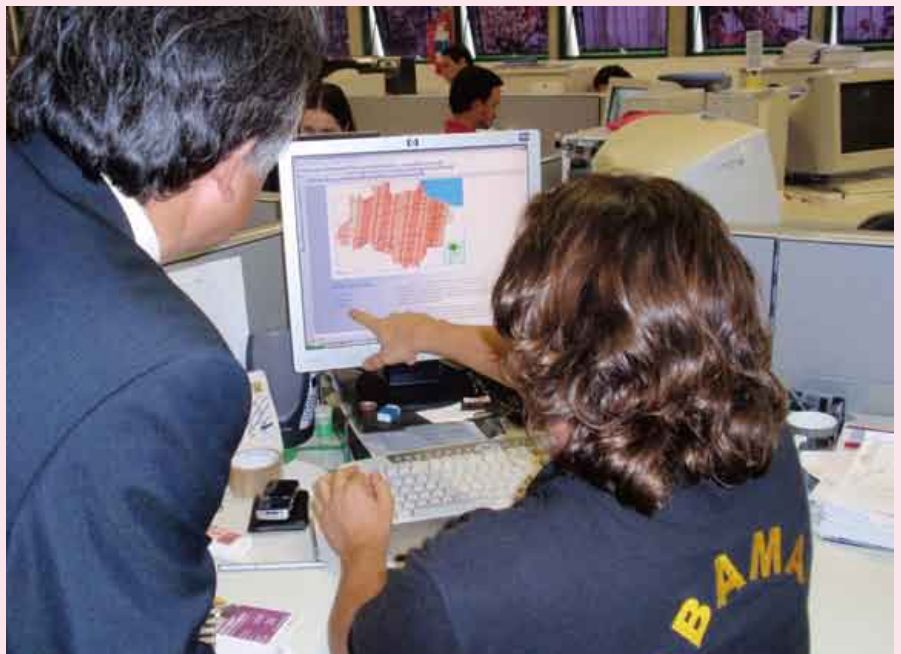
Satellite monitoring system

satellite technology proving a useful tool in environmental conservation. By continuing appropriate management with the help of "Daichi," the project hopes to conserve forests for generations to come.