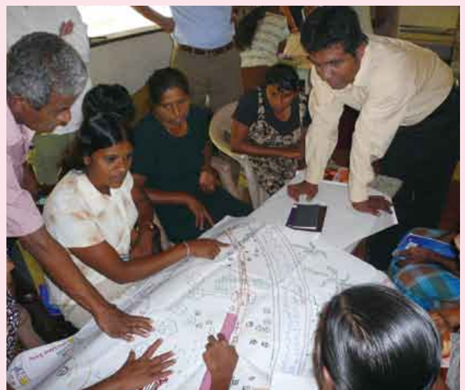
Hazard mapping to analyze areas at risk of disaster within residential areas

Experience and knowledge to protect life and property from disaster, built up over Japan's long history, is now aiding the preparation of disaster mitigation systems in Sri Lanka.