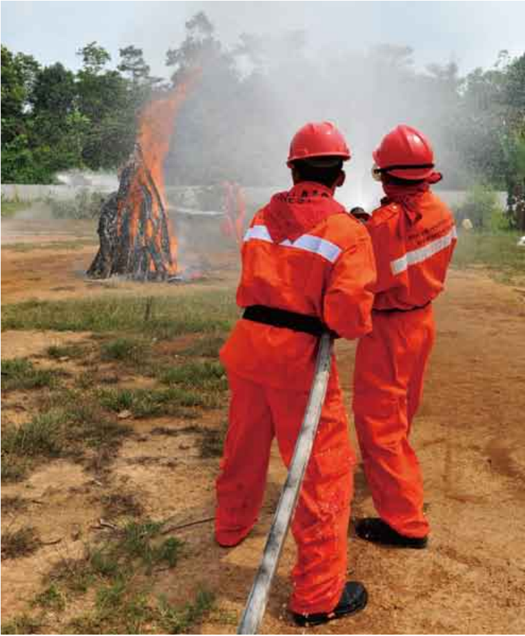
Climate change impact: JICA's activities in Indonesia