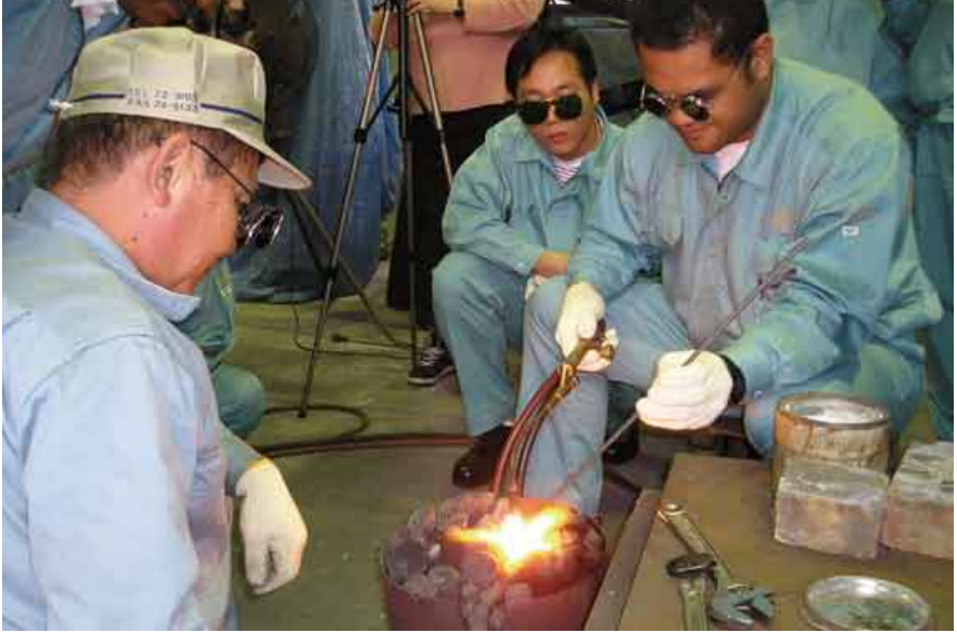
Training participants learn welding techniques. This course helps participants gain internationally recognized welder qualifications (JICA Chubu).

To date, over 200,000 people have participated in Training and Dialogue programs in Japan. These people came to know numerous Japanese people while staying in Japan and returned home with a deeper understanding and familiarity with Japan and a feel for the culture. JICA provides support to the JICA Alumni Association, a group formed by ex-participants themselves in all countries of origin, to foster greater numbers of people with an understanding of Japan in developing countries.