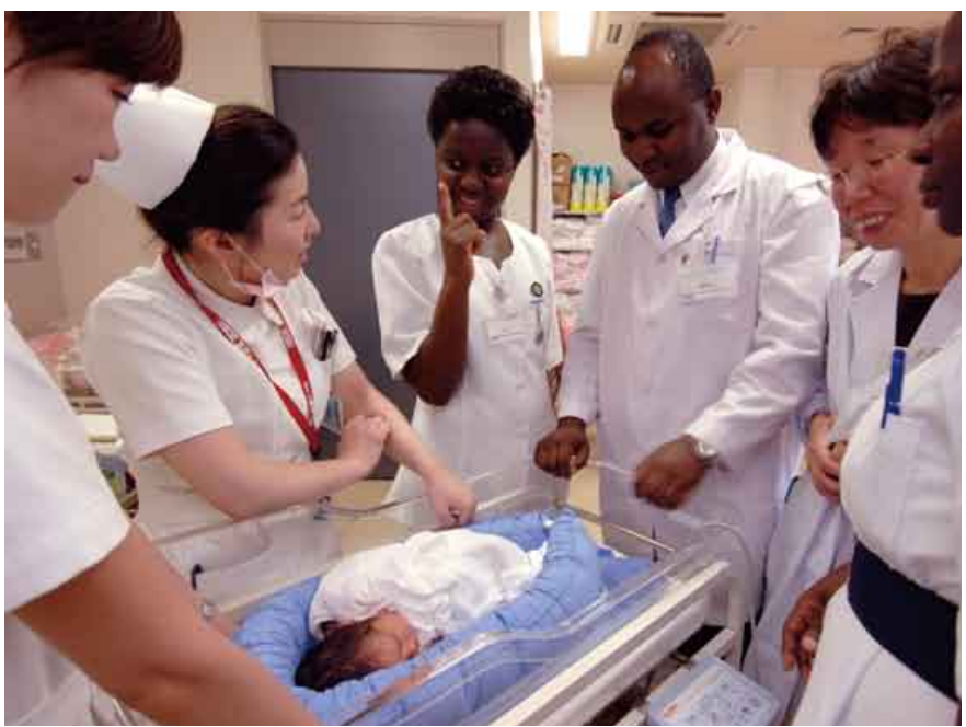
Training participants observe a new type of newborn infant bed designed to simulate the mother's womb (JICA Osaka)