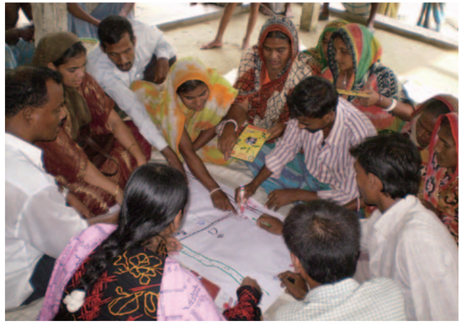
Community activity to confirm the location of the homes of pregnant women on the map, and consider support for maternal and child health (Bangladesh)

JICA is supporting developing countries in strengthening health systems to provide "Continuum of Care for MCH"* by improving the quality of health care and medical services and ensuring access to such services. Specifically, JICA is supporting the promotion of antenatal care for pregnant women in the interest of safe delivery, upgrading health and medical facilities, strengthening of communication and collaboration among different levels of health and medical facilities, creating human