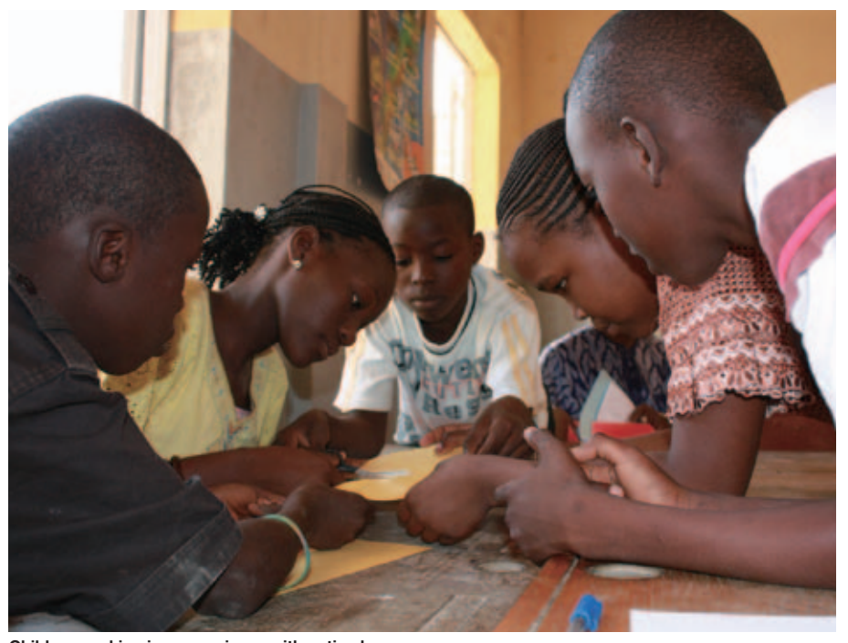
Children working in groups in an arithmetic class (Senegal: Strengthening Mathematics, Science, and Technology Education Project (PREMST))

In particular, in the Sub-Saharan African countries that are the leastdeveloped in the area of education, JICA is providing focused and comprehensive support in accordance with the Yokohama Action Plan that was announced at the 4th Tokyo International Conference on African Development (TICAD IV) in May 2008,