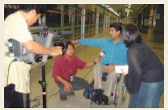
Interview with a man with a disability who was involved in a subway barrier-free construction project (Bangkok, Thailand)