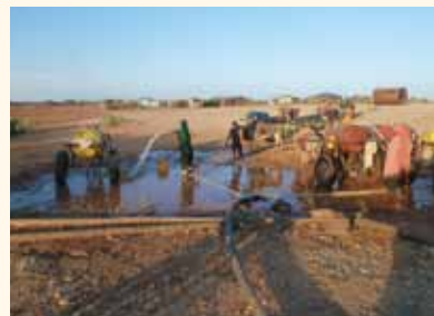
The Kebri Beyah refugee camp in Ethiopia does not have an adequate supply of water.

Droughts occur repeatedly in Ethiopia. JICA has started projects targeting the fields of water and agriculture. For the water sector, the project involves drawing a map of water sources and a water supply master plan. The objective is establishing a water supply system for the arid area including the refugee camps and nearby communities. For the agriculture sector, JICA implements a variety of projects to increase resilience to unstable weather. One is to assist former pastoralists in raising agriculture productivity by establishing irrigation facilities. Another is to assist farmers to improve livestock raising skills and establish livestock markets. There is also a project for weather insurance for farmers that will ensure a minimum level of income even with small harvests. The goal of these projects is to strengthen the resilience of residents from a medium- to long-term perspective.