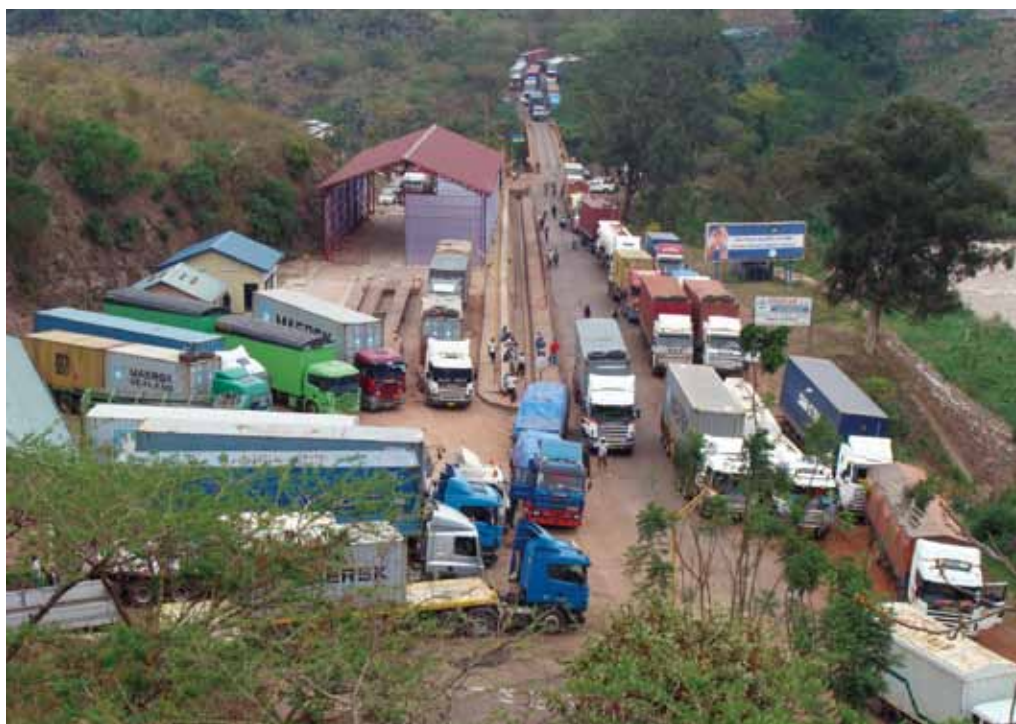
Trucks wait at Rusumo, Rwanda, to cross the border between Rwanda and Tanzania.

In order to enable the efficient flow of goods at border areas, JICA is not only providing assistance for physical infrastructure such as highways, but also introducing the One Stop Border Post (OSBP) system, by which neighboring countries share and apply common and simplified border procedures. One illustration is Rusumo, the border crossing between Tanzania and Rwanda, a key economic corridor in eastern Africa. The highway in this region has been improved and an OSBP system established.