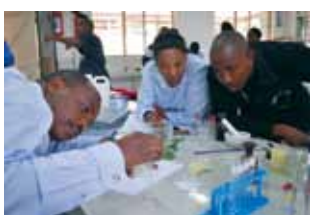
Mathematics and science education training for teachers in Sub-Saharan Africa (Kenya)

JICA is implementing the Better Hospital Services Program with the aim of extending support for improving the quality of hospital services. The program uses Japan's total quality management and KAIZEN methods to improve the quality of these services. One example is Mali where, with the objective of providing safe and suitable medical services, the program is implemented very extensively through activities such as keeping medical facilities neat and clean and organizing the process for sorting waste.