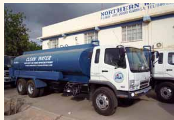
One of the water trucks provided by JICA

Schools serve as regional bases for drought aid. In addition to supplying water, schools provide meals for children and distribute food to nearby residents and perform other roles. Consequently, JICA gave desks, dormitory beds and other supplies to 13 schools in host communities. These activities have increased the interest of residents towards school education. There are reports that applications to attend school are increasing as a result. This leads to expectations for a major benefit for this region where the school enrollment rate is low.