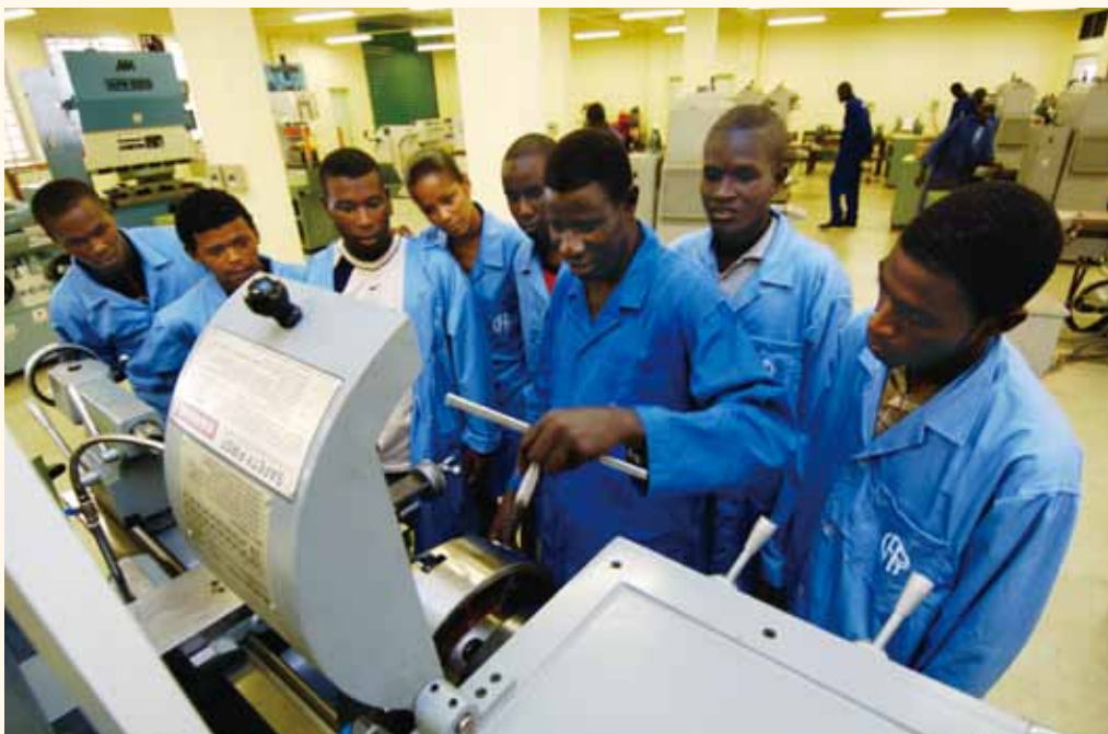
An instructor explains the operations of a processing machine to students at the CFPT in Dakar, Senegal.