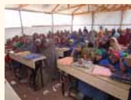
Desks from JICA at a Dadaab refugee camp

had sent 16 more water supply trucks, 450 more water supply banks and other additional supplies. In association with the expansion of support, the Northern Water Service Committee, which is the counterpart agency, contacted the water supply managers in each district to quickly explain the nature and volume of support.