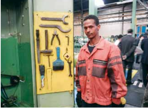
The 5S program was introduced at this Ethiopian factory participating in the KAIZEN project.

In 2011, the United Nations announced a famine declaration for the Horn of Africa because of a drought of unprecedented severity. JICA sent emergency relief supplies. In addition, to address the food crisis caused by the constant drought, JICA started providing support to improve access to water and to strengthen the resilience of farmers and livestock holders in the region [↪ See the Case Study on page 47].