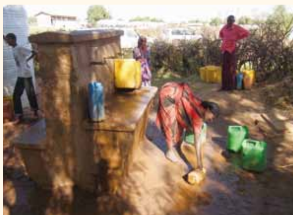
A water supply facility in Gode in the Somali region of Ethiopia