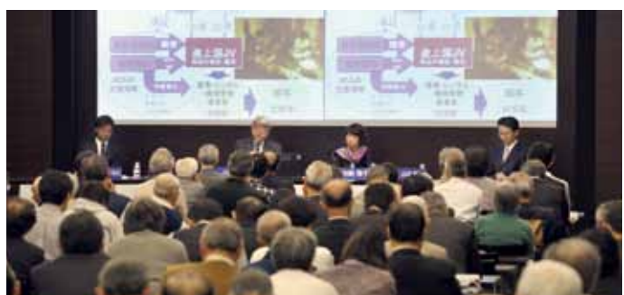
About 250 retail investors attended the seminar.

JICA website → "News," December 5, 2011 news from the field