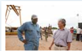
The Juba River Port was established in 2007 with JICA cooperation. Currently, JICA is continuing to provide assistance to increase the capacity of the port system and to further extend the jetty with Grant Aid.

In 2011, the Kingdom of Thailand was struck by massive flooding on a scale seen only once every 100 years. Approximately 18,000 square kilometers were inundated, including industrial zones and agricultural areas. Since many local Japanese companies also suffered damage, the flooding had a serious impact not only on Thailand's economy, but also on Japan's economy.