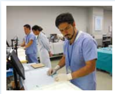
In collaboration with Terumo Corporation, JICA invited Mexican physicians to Japan, conducting the first PPP training course in medical treatment using the method of inserting catheters in the patient's wrist.