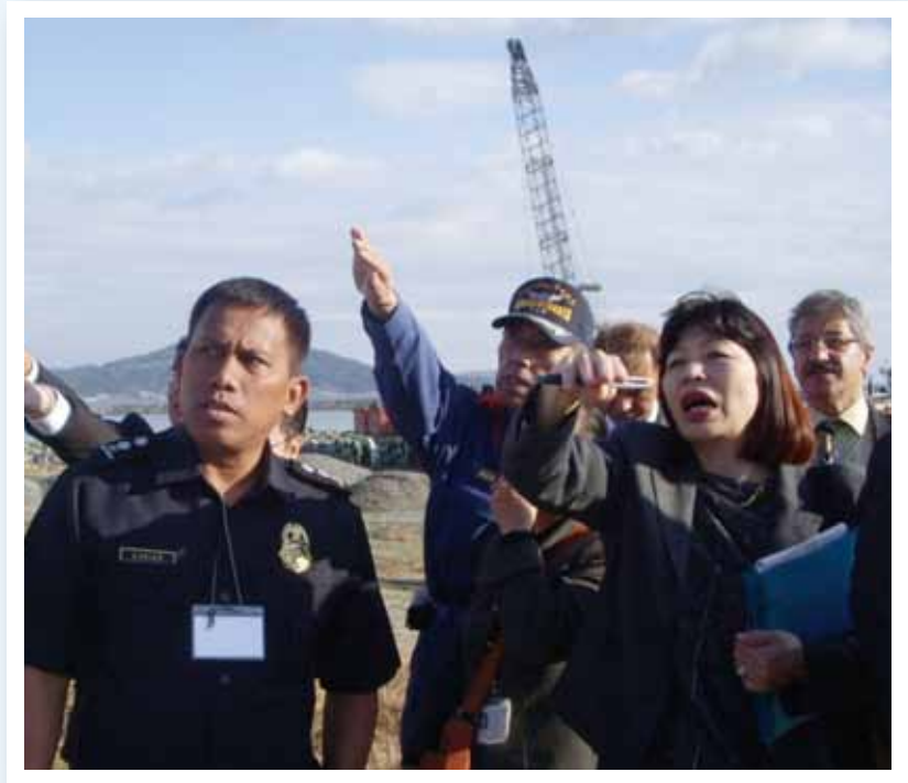
The head of Indonesia's Sub Directorate/ Protection and Empowerment of IDPs of the National Disaster Management Agency listens intently to an explanation of the damage caused by the tsunami in the Great East Japan Earthquake disaster. Indonesia also suffered tremendous damage from a tsunami caused by a major earthquake that occurred off the coast of Sumatra in December 2004.

In addition, in gratitude for the world's generous assistance during the disaster, JICA established reconstruction and disaster prevention and management related training courses and seminars to utilize Japan's experiences from the disaster, bringing approximately 1,000 people from developing countries to participate in the training.