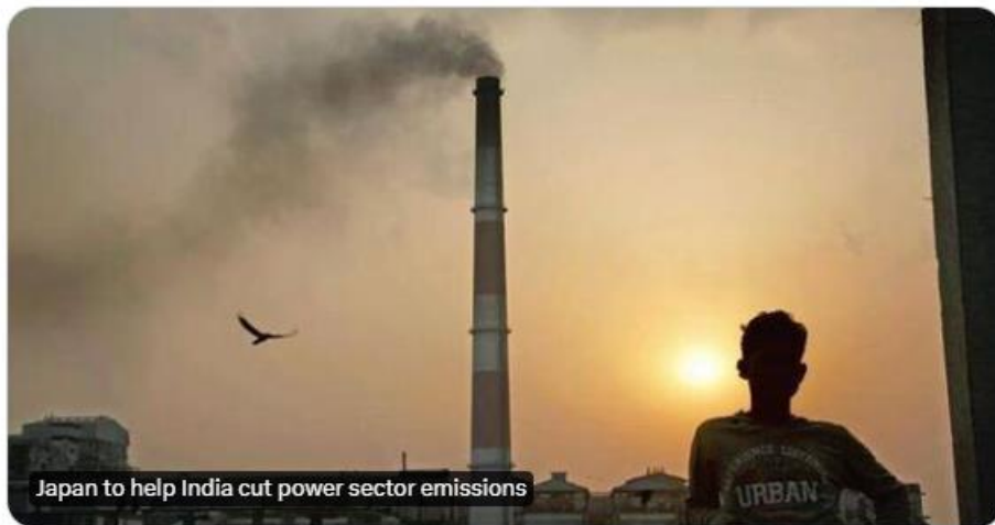
Japan to help India cut power sector emissions