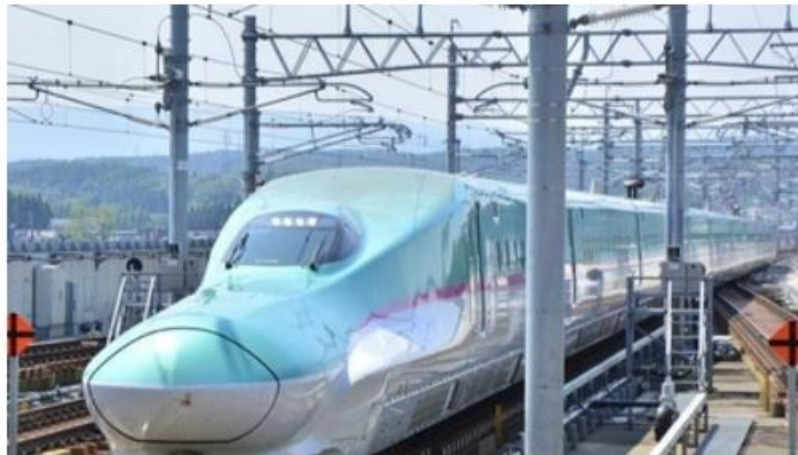
Ahmedabad-Mumbai bullet train | Image/Representational image