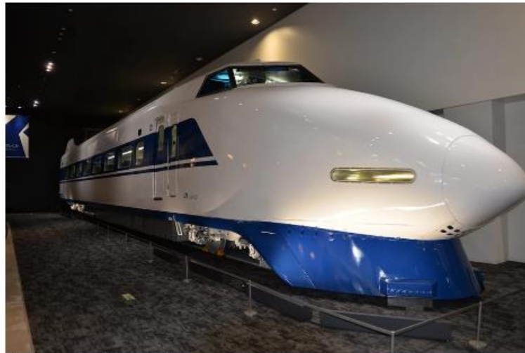
Representative Image

PTI | New Delhi | Updated: 21-01-2024 15:22 IST | Created: 21-01-2024 15:13 IST