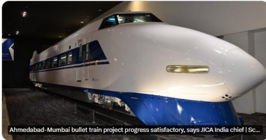
Ahmedabad-Mumbai bullet train project progress satisfactory, says JICA India chief | Sc...

Ahmedabad-Mumbai bullet train project progress satisfactory, says JICA India chief