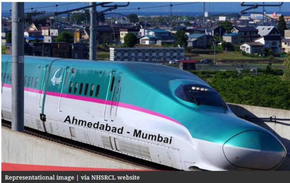
Representational image | via NHRCL website

PTI | Updated: January 21, 2024 15:45 IST