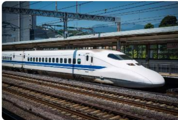
The JICA India chief mentioned that the situation has improved a bit, as earlier it took years to get clearance from the local authority, causing project delays and cost overruns.

PTI Updated On Jan 22, 2024 at 12:28 PM IST