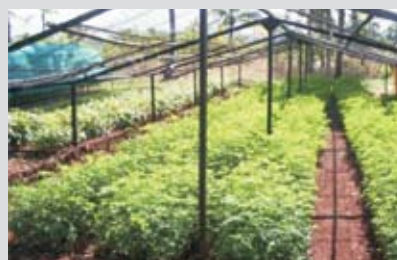
Nursery for horticulture training at RAMETI, Khopoli

Although it has been renamed Regional Agriculture Management and Extension Centre (RAMETI) and