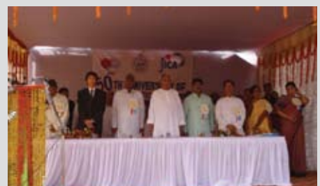
The inaugural ceremony was attended by Chief Minister of Orissa

In November 2008, Department of Water Resources, Government of Orissa, celebrated the trial irrigation of Bhairpur Branch Canal (BBC) which is a branch canal of Rengali Left Bank Canal. Rengali Irrigation Project, with financial assistance from JICA, has been under implementation since 1998. BBC and its distributary canal have been completed and to showcase the progress of the project, the inaugural ceremony was held in the presence of the Chief Minister, the Minister of Water Resources and the Chief Representative of JICA.