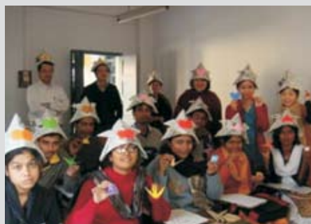
Participants with "Samurai Hat" after Origami Class in "Japan Meet"