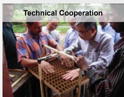
Project for Promoting of Popularising the Practical Bivoltine Sericulture Technology