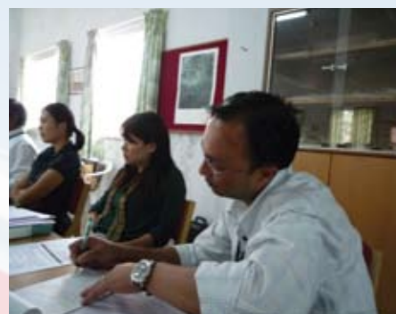
During the Microfinance lecture sessions

JICA Partnership Programme (JPP) is JICA's initiative to support Japanese NGOs, universities and local governments that promote sustainable livelihood of deprived communities in India. JPP supports collaborative projects between Japanese organizations and Indian NGOs working at the grassroots level.