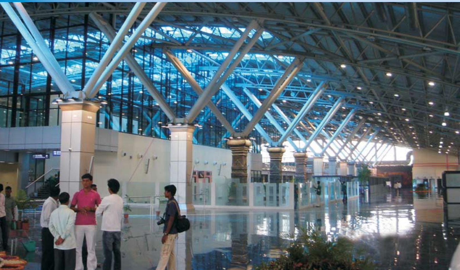
Brand New Terminal of Aurangabad Airport