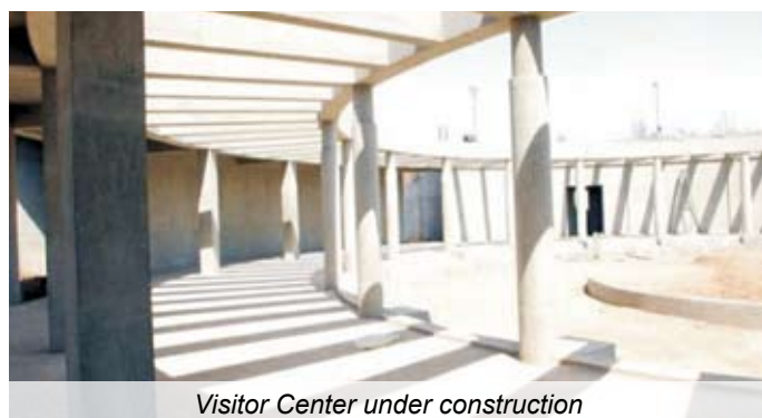
Visitor Center under construction

AAI has been responsible under the Project for upgradation of Aurangabad Airport, which most visitors use as gateway to Ajanta and Ellora Caves. Recently, construction of new terminal building at the airport has been completed. On November 21, 2008, the new terminal was inaugurated by Maharashtra Chief Minister Vilasrao Deshmukh along with Union Minister of State for Civil Aviation, Praful Patel. The new terminal is equipped with aerobridges, escalators, baggage handling systems and CCTV besides other modern passenger amenities. Earlier in the Project, extension and strengthening of runway, etc were implemented. With the new integrated terminal building in place, Aurangabad Airport will facilitate better air connectivity and services, which in turn will bring more visitors to the region.