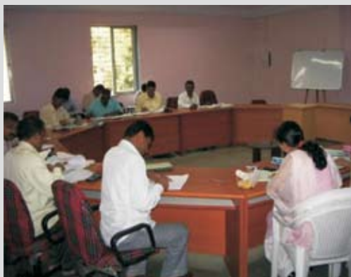
Training of the extension workers on micro-watershed management at RAMETI, Khopoli

shifted its scope of activities to horticulture and the training of extension workers, the staff still appreciate the earlier contribution from Japan.