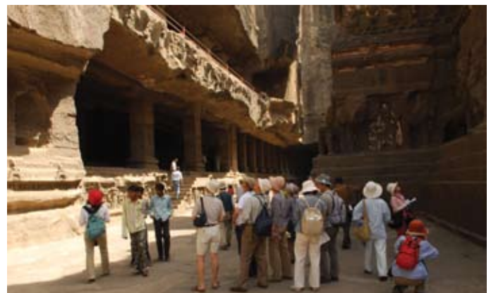
Tourist Groups at Kailasa Temple

In recent years, the dazzling carvings and beautiful wall paintings of both Ajanta and Ellora caves have drawn many domestic and foreign visitors, making these historical sites a top destination in Indian tourism map.