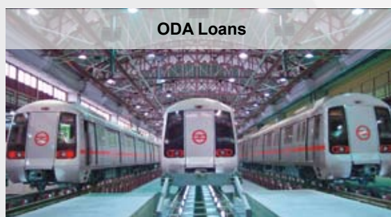
Delhi Metro Mass Rapid Transit System