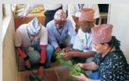
Participants training in the 2 nd batch course