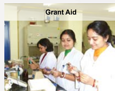
Project for Founding a Collaborative Diarrheal Diseases Research and Control Center