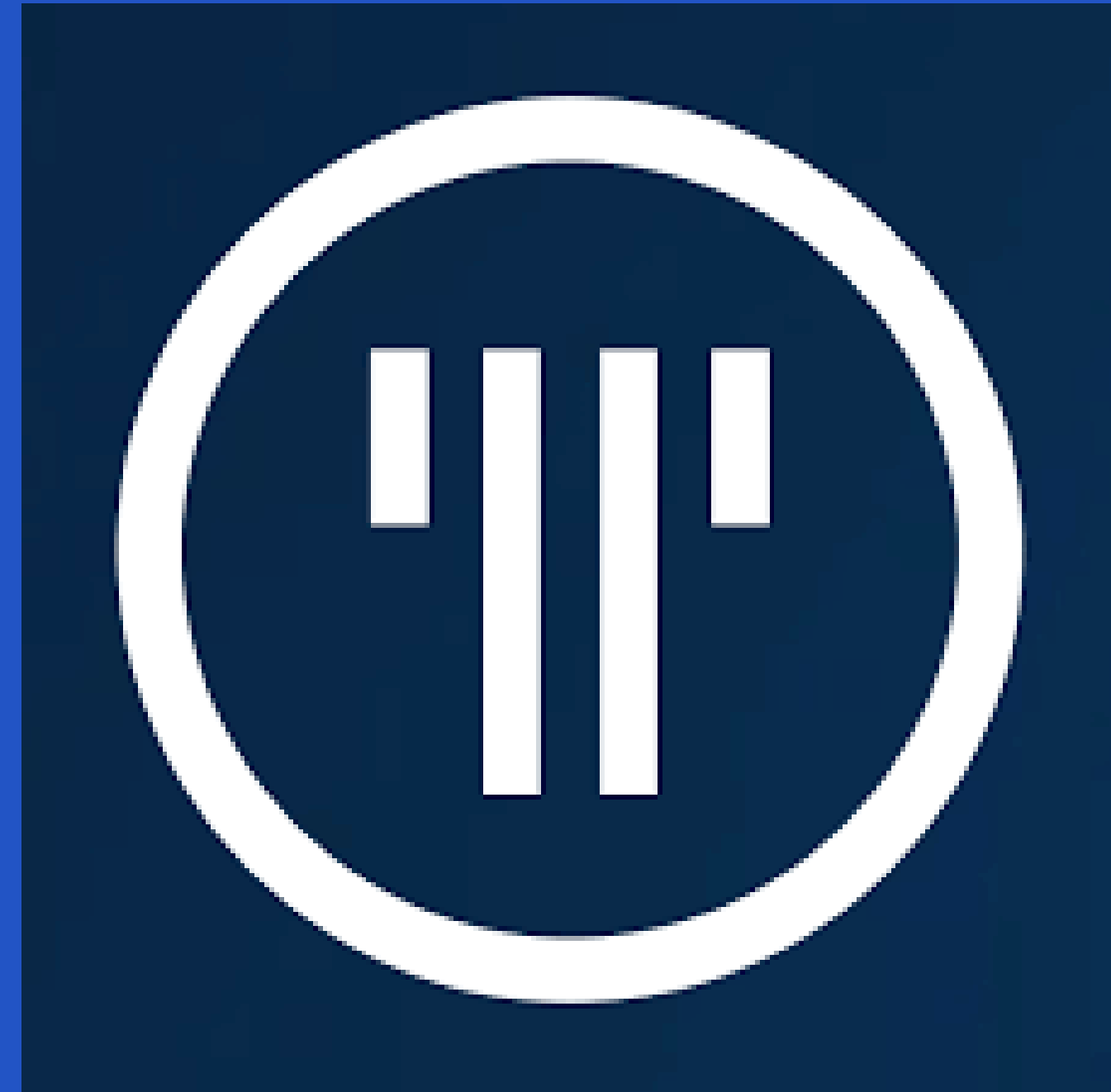
TAB Solution LLC