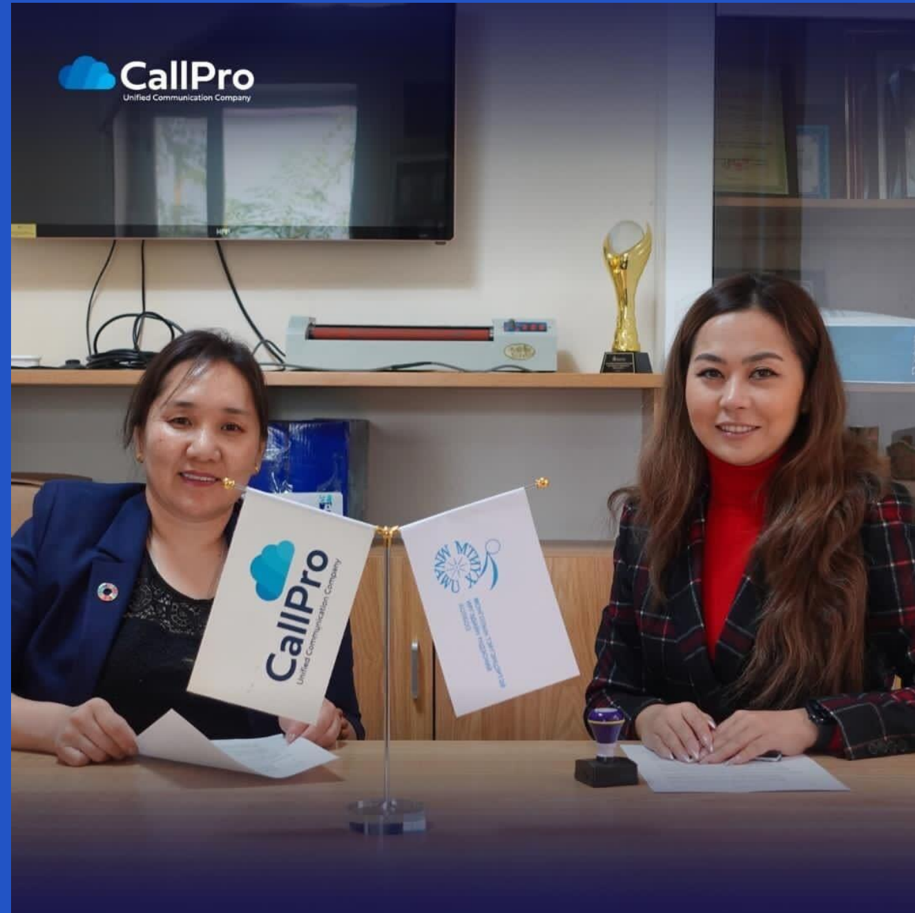
Mongolian National Association of Wheelchair Users