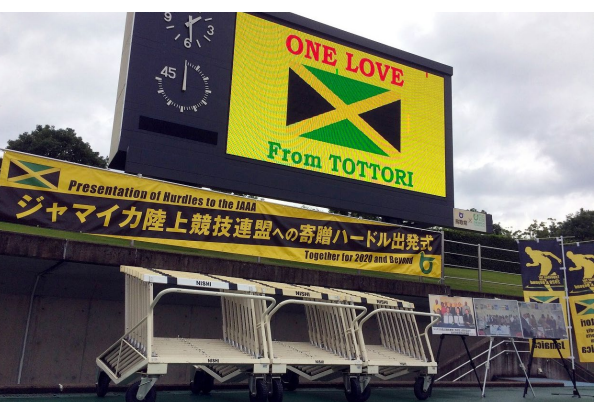
Land hurdles on display in Tottori before being shipped to Jamaica.