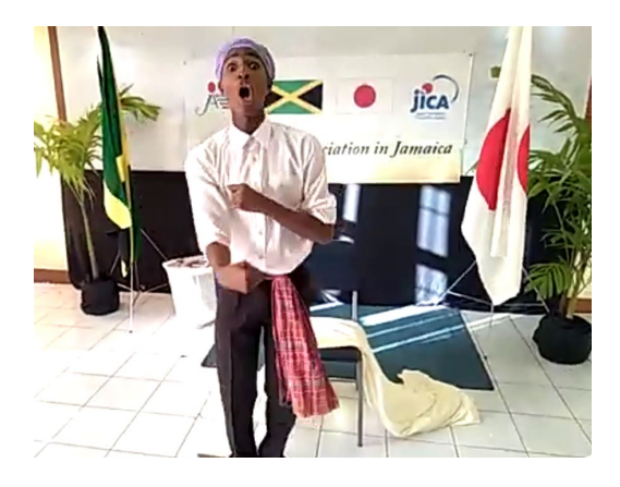
Animated Starz Academy representative demonstrates the expressive nature of Jamaican story telling.