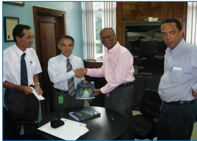
Senior Volunteer dispatched to National Works Agency (NWA) presenting a copy of a Study on GeoTechnical Engineering Practices in Jamaica.