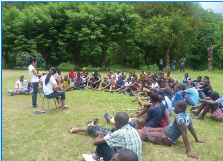
JOCV members participating in JCF Community Safety and Security Summer Camp 2011