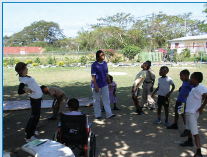
P.E. Instructor conducting a class at the Llandilo School of Special Education.