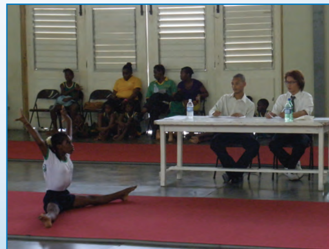
JOCV Gymnastics Instructor assigned to the Jamaica Amateur Gymnastics Association assisting with judging the schools' competition at the Girls Guide Association of Jamaica. 2012