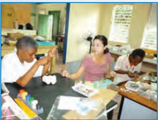
Short Term Volunteer working with participants at the JAID Adult Centre in the Chuspe Studio

Other activities include workshops for teachers and instructors (assisted by Volunteers attached to Jamaica 4-H Clubs), undertaking a needs survey of outlets to sell goods produced at the JAID Adult Centre (Chupse Studio), a one year training/ apprenticeship programme for JAID students at the UCC Coffee Factory, Coffee beans accessory making and sales, Workshops of Art & Craft and gymnastic competitions