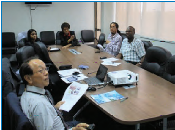
Senior Volunteer - presenting his Final Report to members of PIOJ and NWA - 2011