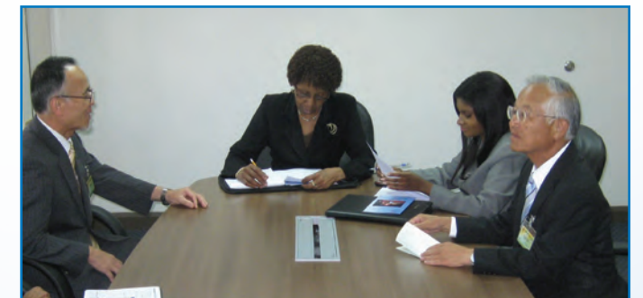
Senior Volunteers in discussions with members of the Bilateral Unit at PIOJ