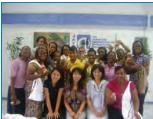
JICA Senior Volunteer, (Special Education Advisor), JOCV Member - Handcraft Instructor, Environment Education Instructor at Jamaica 4-H Clubs at a training with JAID teachers following a workshop.