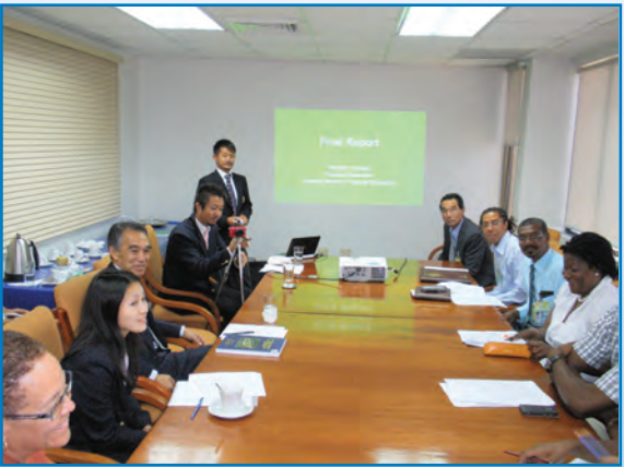
PE Instructor at Edgehill School of Special Education making a presentation on his activities at the PIOJ Final Report Session - Sept 2011