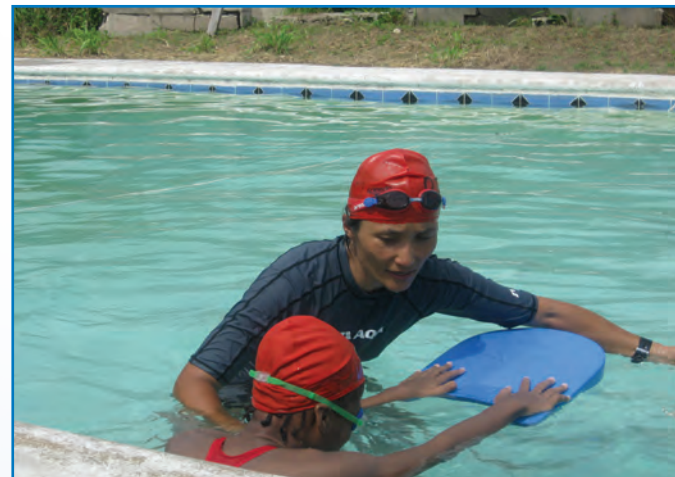
JOCV Member dispatched to the Salvation Army School for the Blind, teaching swimming to blind pupils at the institution.