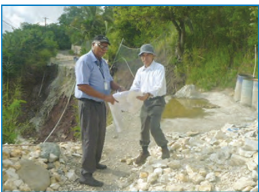
Senior Volunteer - conducting damage assessment in Jack's Hill, St. Andrew.

Recruitment targets people between the ages of 40 to 69 who have a strong desire to participate in cooperative activities in developing countries utilizing their solid experiences, including specialized knowledge and technologies, cultivated over long years.