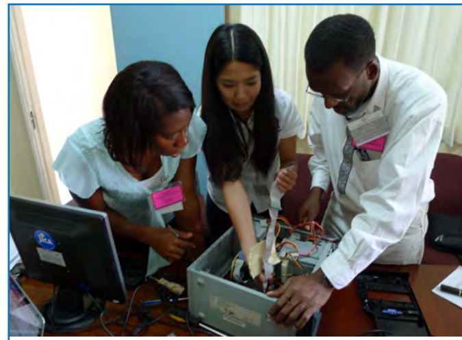
JOCV Member - IT Technician dispatched to Ministry of Education, Region 2 conducting a workshop on computer maintenance.