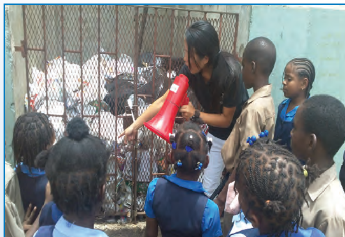
JOCV Member dispatched to the Hanover 4H Clubs conducting an Environmental Awareness session at a primary school.