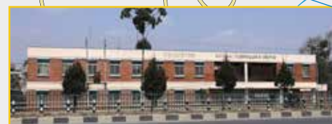
National Tuberculosis Centre, Bhaktapur