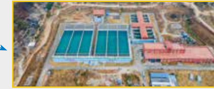
Water Treatment Plant, Sundarjal