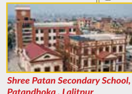
Shree Patan Secondary School, Patandhoka, Lalitpur