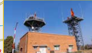
TIA building with Radar