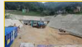
Nagdhunga Tunnel Construction Project - Eastern Portal.