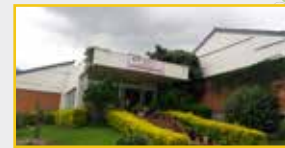
Horticulture Development Center, Kirtipur