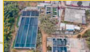
Water Treatment Plant, Sundarjal