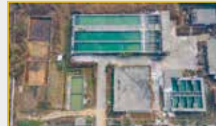
Water Treatment Plant, Bode