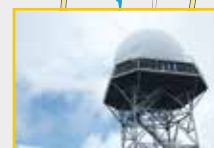
Bhattedanda Radar, Lalitpur