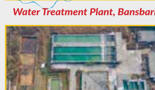
Water Treatment Plant, Bansbari