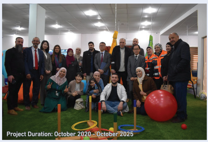
Opening the Sensory Park for children with disability in Disability Center in Jalazone refugee camp in Ramallah