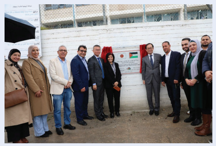
Opening for the Internal Roads Network in Aqbat Jaber refugee camp in Jericho

The objective is to improve the environment of refugee camps by accelerating the planning and implementation of Camp Improvement Plan (CIP), through provision of the Grant, and to improve the livelihood conditions for the residents of the refugee camps in the West Bank through implementing infrastructure development projects.