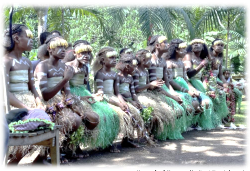
Komuniboli Community, East Guadalcanal The Project on Capacity Development for Sustainable Forest Resource Management in Solomon Islands

Ting Tugeda en Waka Tugeda fo Gudfala Laef blo lumi en Future!