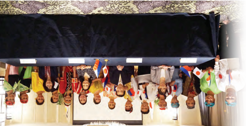
Pre-departure orientation seminar for the KCCP - Young Leaders, Science and Mathematics in Basic Education, 2017