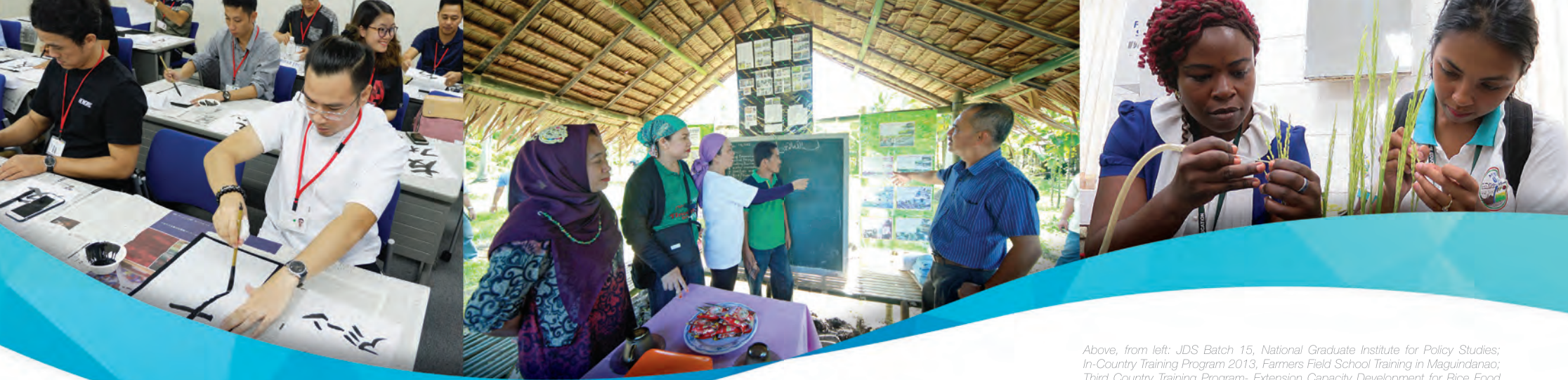
Above, from left: JDS Batch 15, National Graduate Institute for Policy Studies; In-Country Training Program 2013, Farmers Field School Training in Maguindanao; Third Country Training Program- Extension Capacity Development for Rice Food Security in Africa, 2017