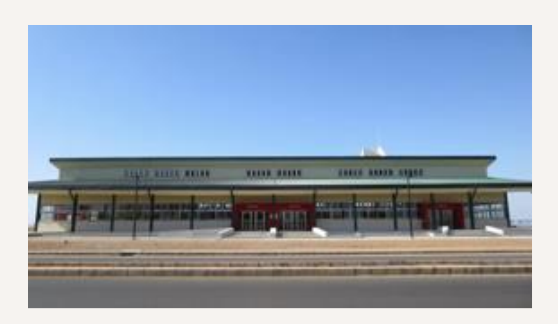
Major fish market in the capital of Mozambique Completed in 2014 with investment of 8 million USD