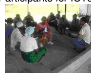
Focused group meeting at Zogoale village