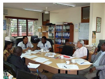
Country Office Staffs in a meeting with the Deputy Executive Director and the Programme Advisor at the TCO room