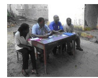
Meeting with Ward Executive Officers prior to interviewing