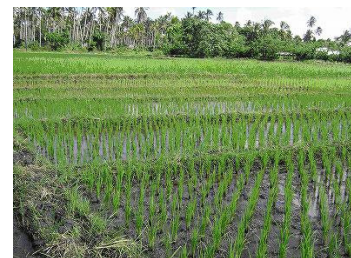
Rice grown and fertilized using effective micro organisms technology at Bumbisudi area, Western district in Zanzibar