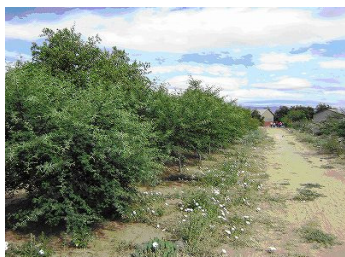
Acacia neglensis trees at NT Primary School in Jobaji, Karatu, Arusha