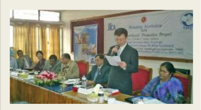
Planning Workshop, Narshingdi

Additional Resident Representative JICA Bangladesh