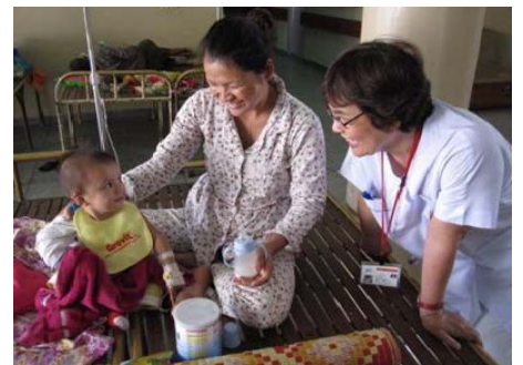
Activity at Hospital Building