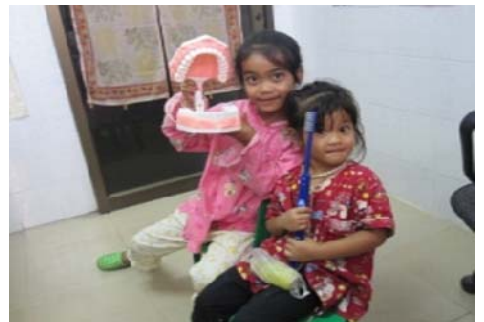
Health education, teaching children to brush their teeth.