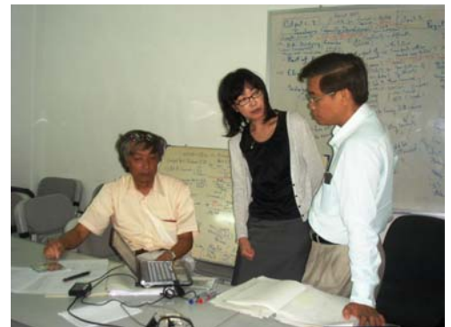
state of the discussions between Counterparts and experts

when considering in long-sighted outlook.