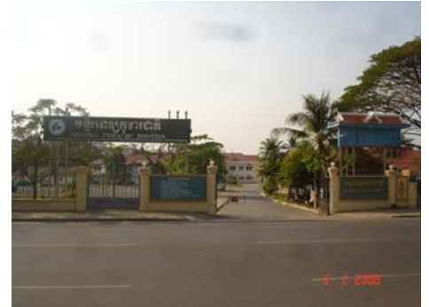
National Pediatric Hospital

Now, nurses are creating training plan in wards, they make presentation by turns and show wonderful growth. For