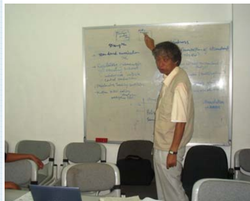
Consultation Meeting with Counterpart

Please go to the project homepage via the address below: http://www.jica.go.jp/project/cambodia/004/index.html