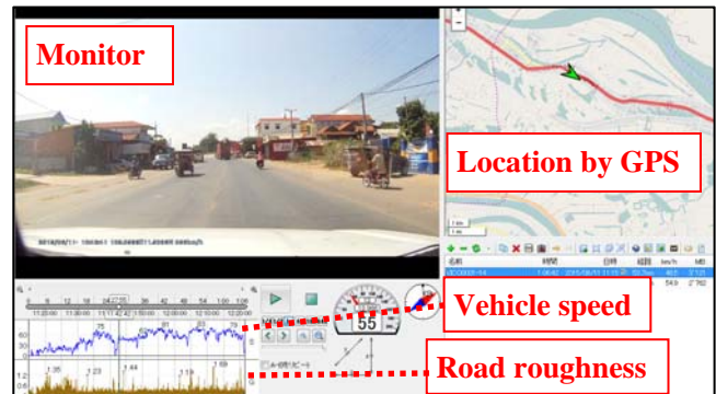
Fig.4 Demonstration of IRI Measurement Using DRIMS