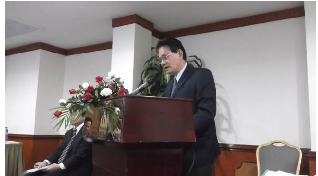
Fig.2 Opening Remarks from H.E. Tauch Chankosal

As the Japanese latest technologies, 1) Bridge Inspection and Evaluation System, 2) Dynamic Response Monitoring Intelligent System (DRIMS), and 3) Bridge Maintenance Engineering of Hanshin Expressway in Japan were presented and attracted attention of the audience.