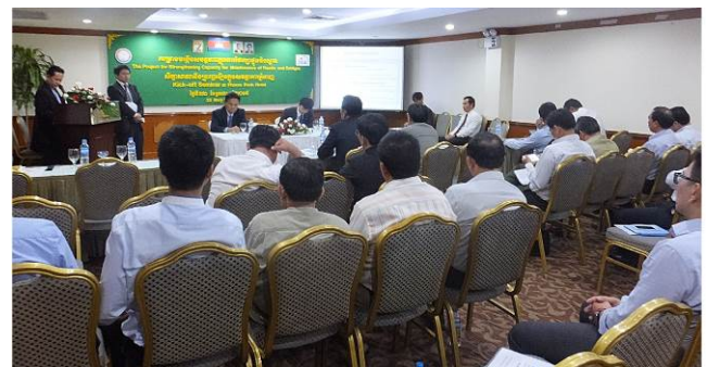
Fig.6 Open Discussion on the Presented Topics