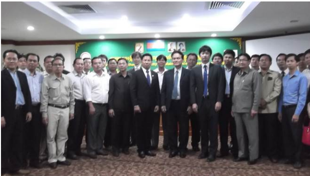
Fig.1 Group Photograph