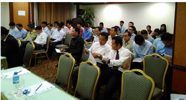
Fig.5 Audience Listening to the Sessions