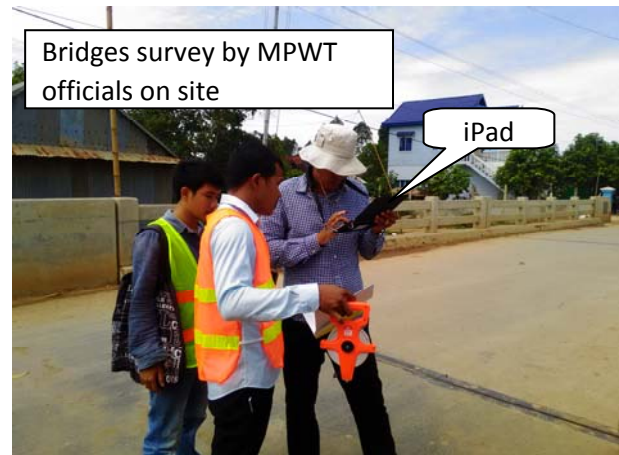
Bridges survey by MPWT officials on site