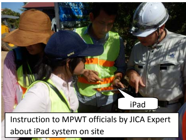
Instruction to MPWT officials by JICA Expert about iPad system on site