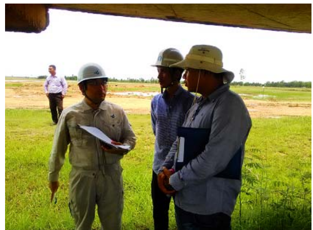
Fig.4 Hearing to DPWT officers