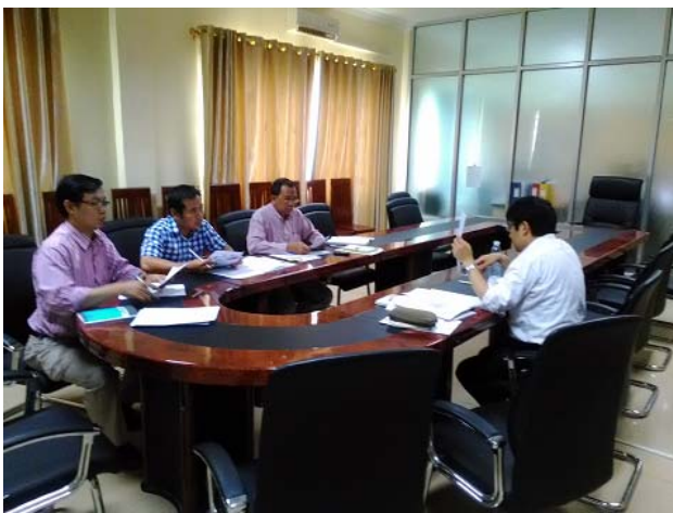
Fig.1 State of the bridge maintenance manual

The MPWT officers and JICA experts are preparing 'Bridge maintenance manual' (Fig.1). This manual is intended to guide the inspection of bridges and it will be prepared for the first in Cambodia. This manual will have been developed based on site investigation (Fig.2).