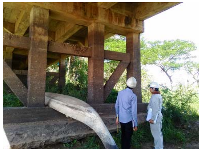
Fig.2 Site bridge investigation

'Bridge Maintenance Manual' will be provided as following (Fig.3).;