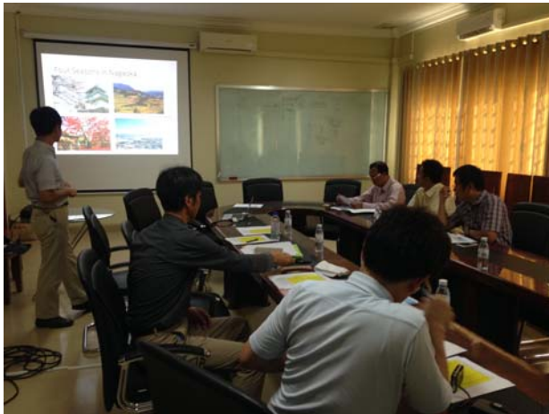
Fig.1 3rd workshop

Workshop was held on 27 th October, when three options at Tsubasa Bridge against overloading countermeasures were introduced (Fig. 1, 2). From MPWT side, preferences were addressed to early implementation program. Countermeasures that do not include local measures were preferred such as option2 (Fig.3, 4). At the same time, future increase of traffic demand should be taken into account. It is also stressed the mal-function experience of HSWIM management should be addressed not to repeat the error.