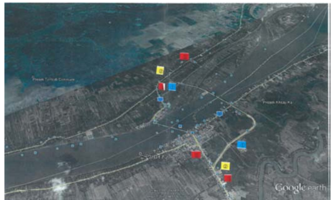
Fig.2 three options