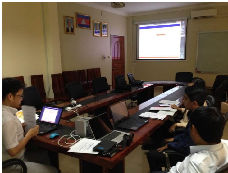
Activity: Database training