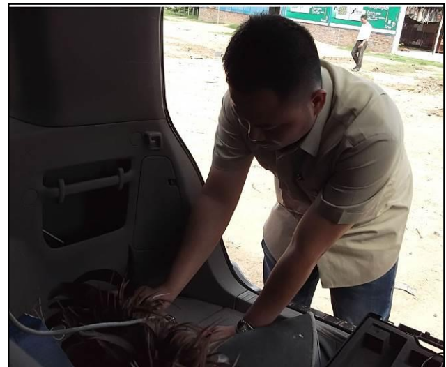
Fig.2 Installation of DRIMS Equipment into the Inspection Vehicle