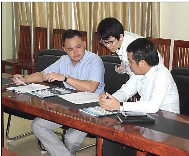
Fig.1 Lecture on DRIMS Operation

Day-3: Lectures on Inspection Result Review and DRIMS Operation without the trainer's instructions