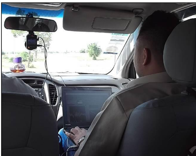
Fig.3 DRIMS Operation in the Inspection Vehicle