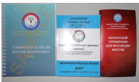
Figure.4 3 types of handbooks introduced by RID