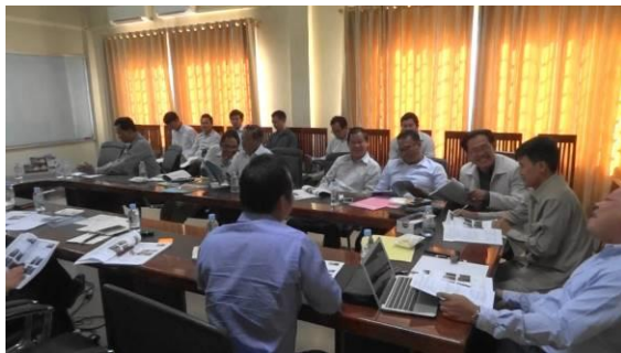
Figure.2 A look of the meeting held in Phnom Penh on December 14 th , 2016