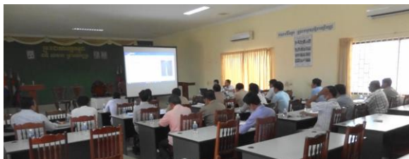
Figure.3 A look of the meeting held in Kompong Cham on December 21st, 2016