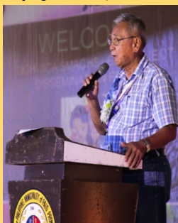
Hon. Rafael Omega / City Councilor of Ormoc City