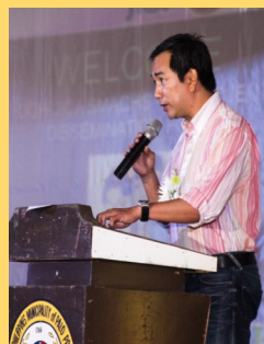
Hon. Carlos Jericho Petilla / Governor of the Province of Leyte