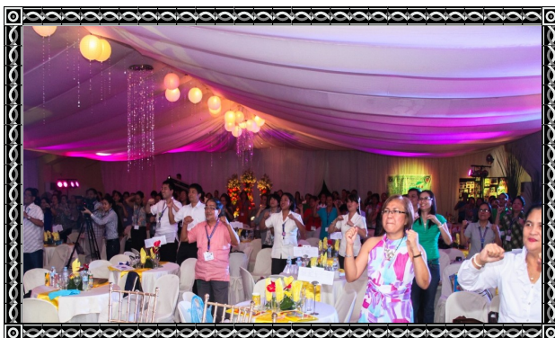
The participants during the forum dancing with "Sa Health Center, Sigurado ka!" song.

On the 16th of May 2012, a Dissemination Forum was held for enhancing the understanding of SMACHS-EV Project and its activities, to share good practices identified through the project activities, and to disseminate such practices and project experiences for possible replication in other regions. A total of 265 participants from the different parts of the country, representing a cross section of health policy and decision makers, health service implementers and local chief executives, attended the one-day activity.