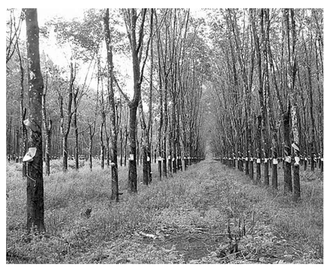
RUBBER PLANTATION. A comprehensive survey covering a total area of 15,000 hectares of rubber farm areas in Lamitan has been completed recently by the ARMM rubber industry cluster team in Basilan. Data collected are now being sorted, validated and analyzed by the cluster team. Photo shows a typical rubber plantation in Mindanao.