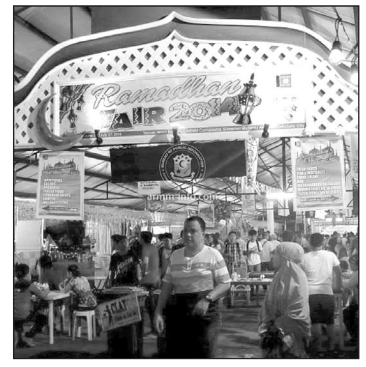
ARMM TRADE FAIR. Holding a trade fair during the month of Ramadan has become a tradition as Moslems all over the world observed this Holy Month of Ramadan. Led by DTI-ARMM, the event has been attracting thousands of visitors and traders from neighboring areas.