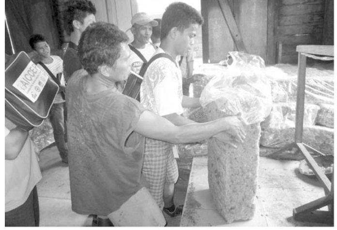
TRADING POST for raw rubber and semi-processed rubber will soon rise in the City of Lamitan in Basilan island. Rubber trading center is one of the plans this year drawn up by the ARMM Rubber Industry Cluster. Photo shows workers packing raw rubber for traders buying the commodity.