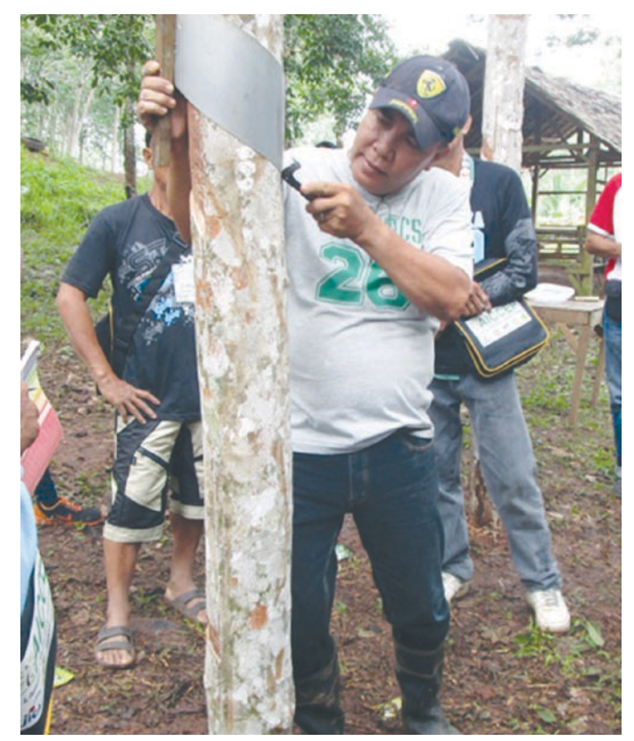
ASIAN rubber producers agreed to share high-yielding clones in the Asia-Pacific region. Mindanao rubber researchers are developing high-yielding clones to improve the quality of rubber from the Philippines. Photo shows rubber farmers training with experts at a rubber plantation in Basilan island.