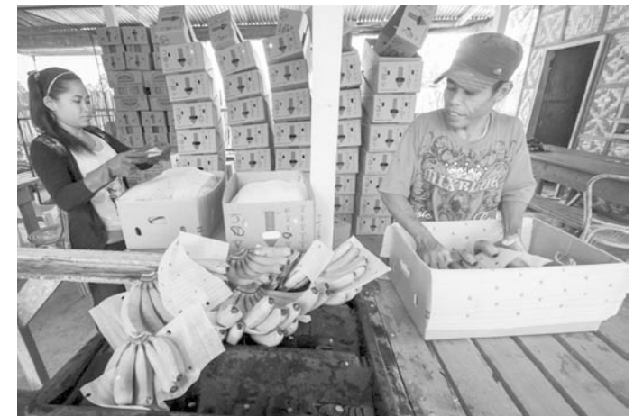
PHILIPPINE banana exports are down as production buckles from the harsh effects of El Nino in the country these past months. Japan is still the Philippines' top banana importer.

"What we did is we joined hands with Department of Science and Technology (DOST) and work on improving the quality of rubber. We met with all