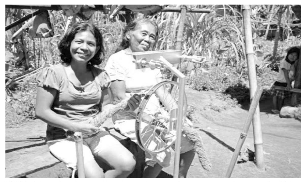
LANAO villagers learning to make twines and geonets from coconut husks are earning higher income these days. Geonets have a huge global demand.

Apart from providing employment opportunities to almost everyone in many villages , he also attributed to the growing enterprise the reduction of petty crimes like theft in their area.