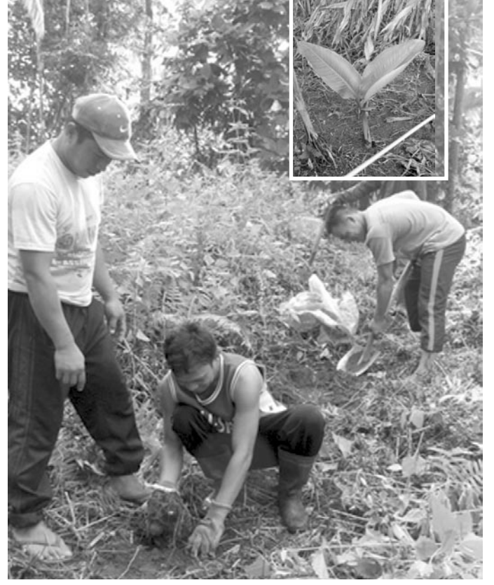
NEW ABACA plants are now growing at the three nursery sites in Lanao del Sur as abaca farmers got the seedlings from the ARMM Abaca Industry Cluster team who worked closely with FIDA and DA for technical assistance.

The active Lamitan city mayor in her role as the rubber industry cluster chair person joined the cluster team recently in distributing a total of 225 pieces of tapping knives, 360 plastic coagulating pans and 310 copies of their Rubber