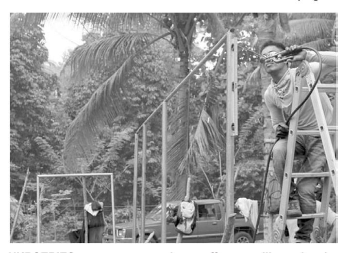
NURSERIES are now growing coffee seedlings in the island of Sulu after the ARMM Coffee Industry Cluster team worked overtime to set up coffee nurseries for farmers in the southernmost island.

"We will continue all our training activities with the help of our partner government agencies and the city government. We will also set up rubber nurseries to produce high yielding clones," says Narsico during a recent Davao meeting with JICA consultants.