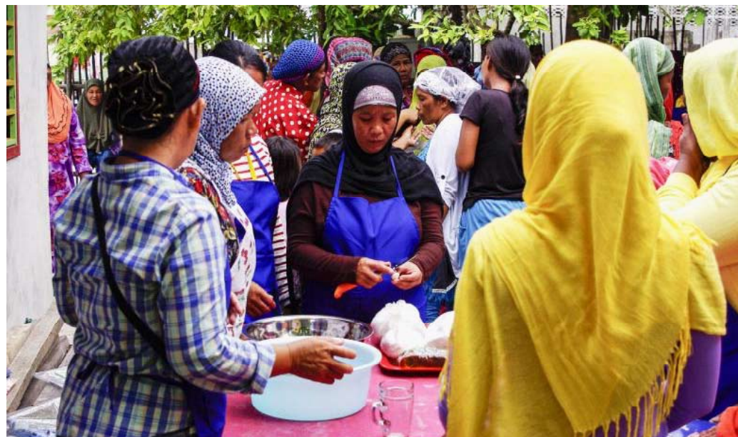
EVERYONE in the Autonomous Region in Muslim Mindanao are expected to benefit from the various anchor projects of Japan International Cooperation Agency under the development plan of the Bangsamoro Development Agency, assuring peace and development in Mindanao. Photo shows ARMM women participating in a food processing training workshop conducted by one of the six ARMM industry clusters.

Regardless of the outcome of the peace process, JICA vowed strong support and commitment towards achieving peace and development in the Mindanao region, according to JICA Chief Representative Noriaki Niwa. (PNA)