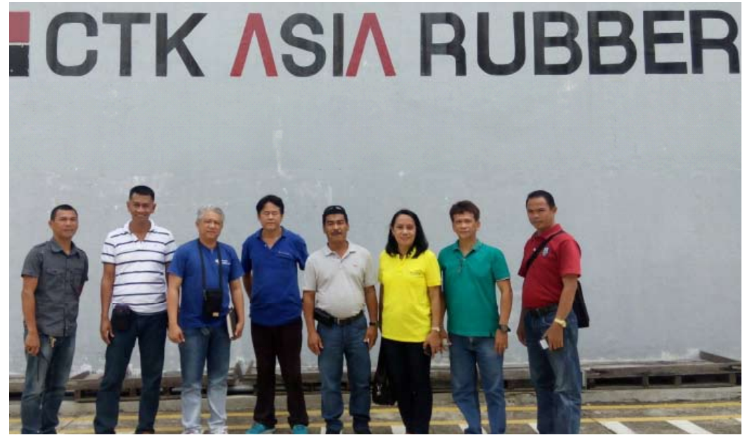
MARKET MISSION. A visit to a Korean rubber manufacturer CTK Asia Rubber in Zamboanga City gave the ARMM rubber industry cluster a good idea of the high market demand for raw rubber and its high quality requirements. Photo shows the rubber industry cluster members posing with the general manager and staff of the manufacturing firm.