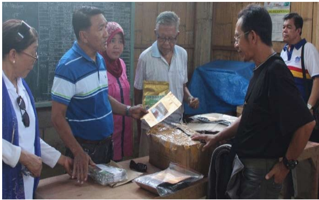
PRODUCT PACKAGING. Coffee packaging materials like label designs, stickers and coffee bags were turned over to members of the KanKitap Consumer Coop and Sulu Coffee Marketing Coop by the coffee industry cluster team recently to begin marketing their local coffee brand Kahawa Sug in coffee shops, grocery stores and trade fairs. Also provided were packaging machines like sealers and weighing scales for coffee growers to do their own packaging.