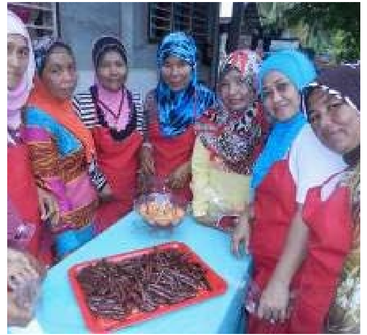
SEAWEED SNACK. Tawi-Tawi women show off samples of a snack food they processed out of dried seaweeds during a training workshop on seaweed value-adding and food processing.