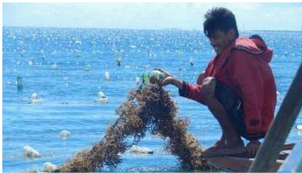
TAWI-TAWI SEAWEED farmer pulls up a long line of floating seaweeds off the coast of the island province, showing off robust growth after months of waiting. Growth rate of quality seedlings planted the previous months, show growth hitting 400 to 500% performance.