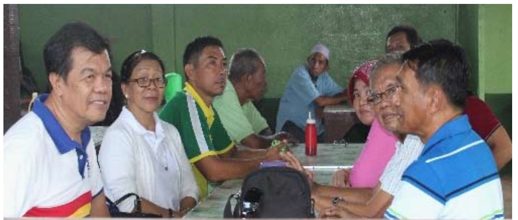
COFFEE CLUSTER team holds meeting in a coffee shop in downtown Jolo, discussing ways to promote their local coffee brand "Kahawa Sug" produced by two farmers' coops in the island province. Trade fairs participation and expanding areas of promotion campaign were agreed.

In 2012 the Japan International Cooperation Agency (JICA) linked up with the BDA to seek out projects worth cultivating for residents in conflict-affected areas in central Mindanao. (Manuel Cayon / BUSINESS MIRROR)