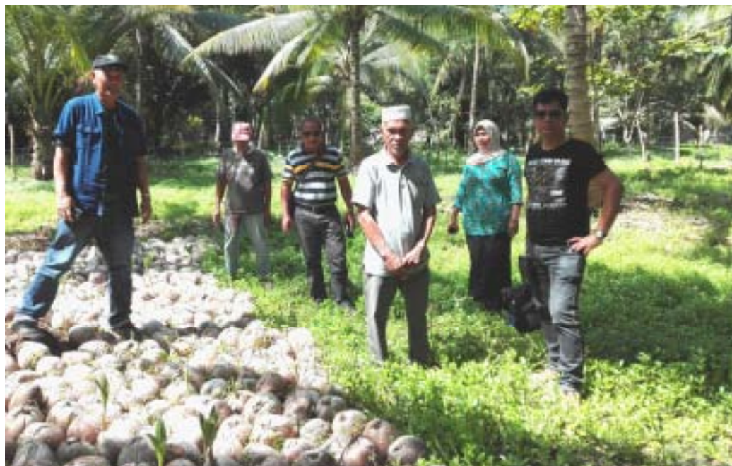
COCONUT FARMERS at the Datu Odin Sinsuat Nursery pose beside new coconut seedlings being prepared by the coconut industry cluster in Maguindanao province to boost the growth and development of the industry in the Autonomous Region in Muslim Mindanao.