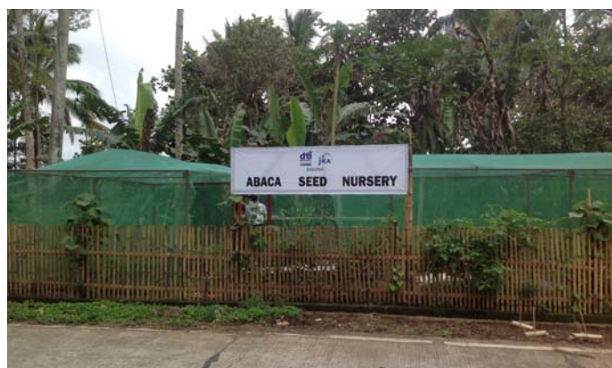
ABACA SEEDLINGS in this farm nursery in Lanao del Sur are growing robust and healthy to be ready for planting in the months ahead, as more and more Lanao farmers are expressing keen interest to start farming abaca full time in various farm villages in the province.