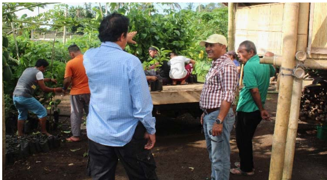
COFFEE FARMERS in Jolo, Sulu, are joining the industry cluster in increasing numbers as the growth of the industry gathers more momentum in the ARMM region. Photo shows Sulu farmers availing themselves of quality coffee seedlings provided by the cluster team.