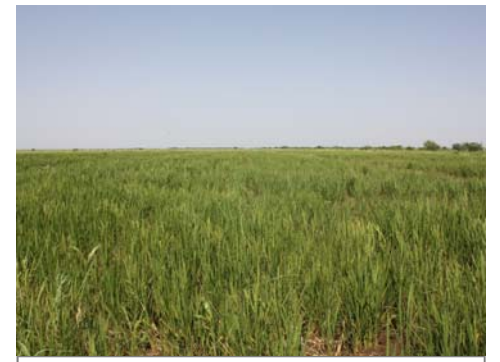
Maiurno Demonstration Site in Sennar State