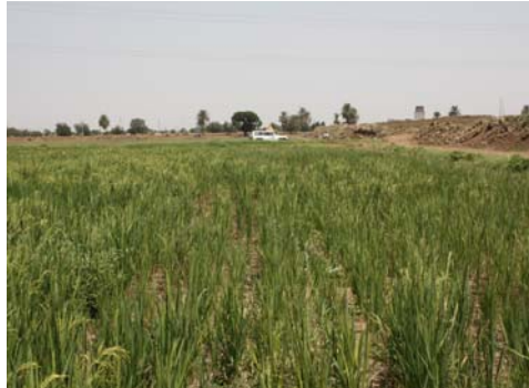
Abu Juwali Demonstration Site in Gezira State