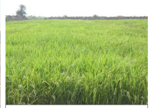
Wad Al Naim Demonstration Site in Gezira State