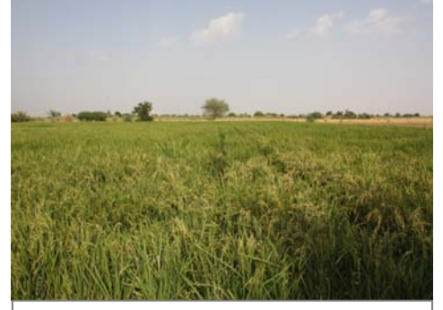
Atbara Demonstration Site in River Nile State