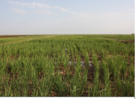
Area 44, Rahad scheme Seed Production Site in Gezira State