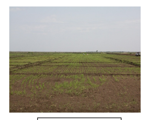
Rice at three weeks after sowing