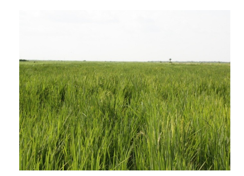
Rice at heading stage in October