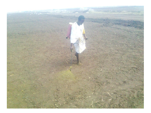
Herbicide Application (Pre-emergence)