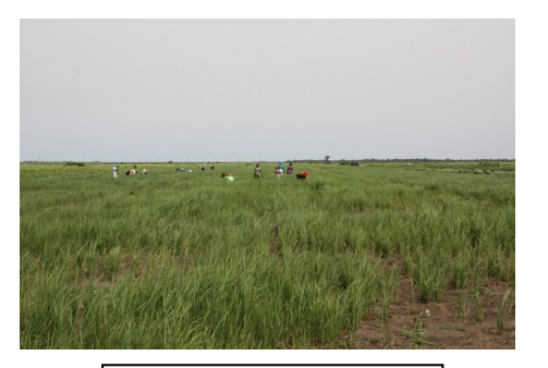
Intensive weeding at nine weeks after sowing