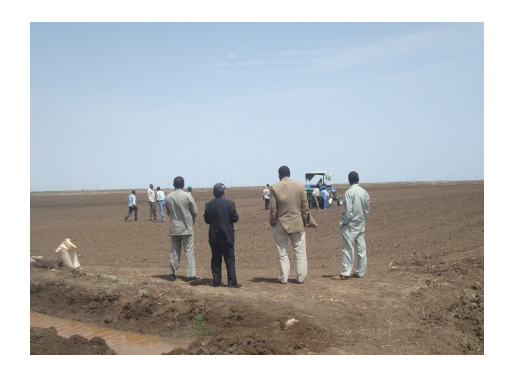
Sowing on July 3, 2013 after land preparation and Dr. Rodwan (Sennar Minister of Agriculture) observed sowing operation.