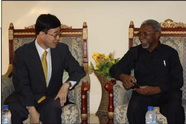
In the morning of the day, Japanese Ambassador and Acting Governor talked each other in the Guest House of Gezira State.