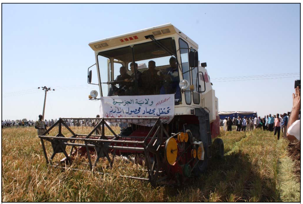
Acting Governor of Gezira State, Japanese Ambassador and State Minister of FMoAl harvested upland rice with combine harvester.

Breakfast Rice Field Day at Faris demonstration field, in Gezira State, was held on 5th November 2014. Approximately 350 people participated in this event, including Japanese Ambassador, Acting Governor of Gezira State (Concurrently Minister of Gezira State MoA), State Minister of Federal Ministry of Agriculture and Irrigation (FMoAI), Minister of Gedaref State MoA, Senior Representative of JICA Sudan Office, etc. 27 media (2 TV, 2 radio, 20 newspaper, 3 others) also came to report this