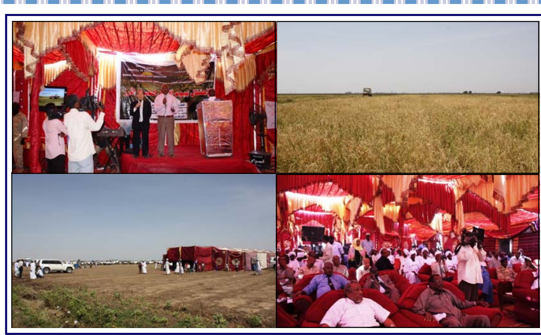
The venue of the Field Day. Kassab demo farm was ready to harvest on that day. A lot of farmers of Kassab also gathered.