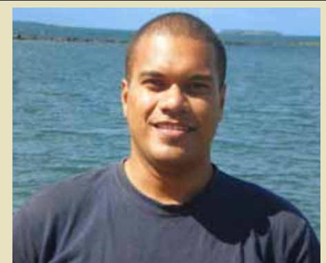
What is your home country?

What programme are you currently enrolled in? Master of Science in Marine Science.