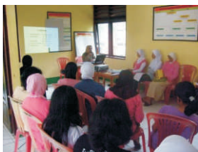
Training of Posyandu Cadre August 27, 2008 Harapan Village Office Harapan Village, Tanete Riaja Subdistrict Barru District