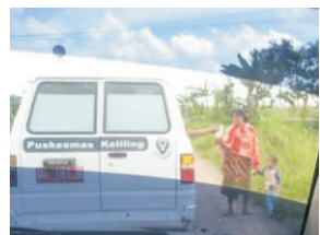
Mobile Elucidation about Diarrhea September 11, 2008 Puliwatie Village, Gilireng Kelurahan, Abbatireng Village, Maminasae Village, Poleonro Village, Lamatta Village Gilireng Subdistrict, Wajo District