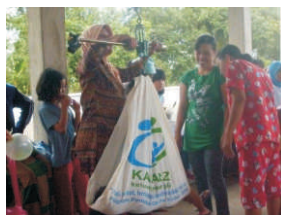
Supply of Addition Food and Elucidation of Nutrition of Pregnant Mother, September 9, 2008 Posyandu of Topaleo, Bonto Nyeleng Village Gantarang Subdistrict, Bulukumba District