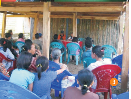
Photo Description : 1. PHCI information board about the activities, realization of activity and fund channelization for each activities as transparency media. 2,3. PHCI team held socialization about responsibility briefly to community about realization activity

by : Arthelia Gita Lestari Field Consultant of Wajo District