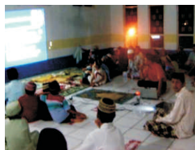
Elucidation about the importance of use MCK September 10-11, 2008 Mattirowalie Mosque Mattirowalie Village, Maniangpajo Subdistrict, Wajo District