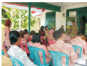
Training Mechanism of PHCI August 26, 2008 Coppo Village Office Coppo Village, Barru Subdistrict, Barru District

by : PHCI Team of Wajo Riaja Tanasitolu Subdistrict, Wajo