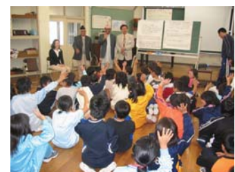
Presentation about Nepal and interaction between children after presentation