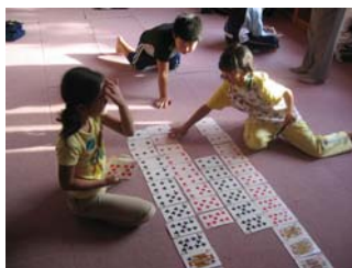
Playing children in hall

This centre provides care service for children whose parents are working. There were three facilitators at this centre and all of them have nursery teacher license in education.