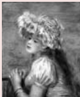
Pierre Auguste Renoir "Girl in a Lace Hat" 1891, Oil on canvas, 55.1x46.0 cm

Art lovers who have not yet had the opportunity to visit the Pola Museum in Hakone can now view these gems at their leisure in Tokyo. Never miss this opportunity!