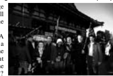
Visiting Sensōji Temple on Jan. 1, 2005

If you are staying at JICA Tokyo and do not have a proper idea how to spend the New Year, how about joining the tour to see the traditional Japanese custom?