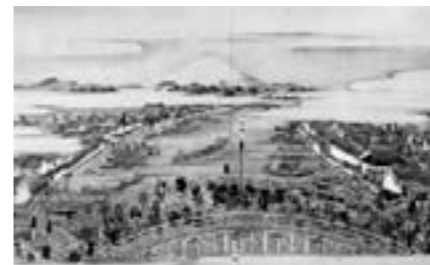
"Kidaishōran" picture scroll (command a view of Mt. Fuji from the Nihonbashi bridge), possessed by the Berlin Oriental Museum in Germany.

Nihonbashi, the center of economy and culture of Edo and the starting point of Five Highways is one of the famous places in Japan. First class painters like Hokusai, Hiroshige and Kiyonaga depicted the area around Nihonbashi. It was always crowded with merchants, craftsmen, priest and artists.