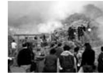
Owakudani (a valley with volcanic hot water springs)

The tour will take you to Hakone Shrine, Hatajuku Wooden Mosaic Center and Hakone barrier station. Poking around Owakudani, a smelly volcanic hot water springs and cruising Lake Ashi will give you opportunities to enjoy different aspect of Hakone. Never miss this great opportunity to take a trip to Hakone!