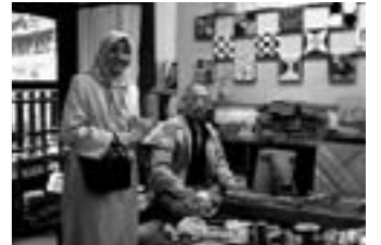
Hatajuku Wooden Mosaic Center