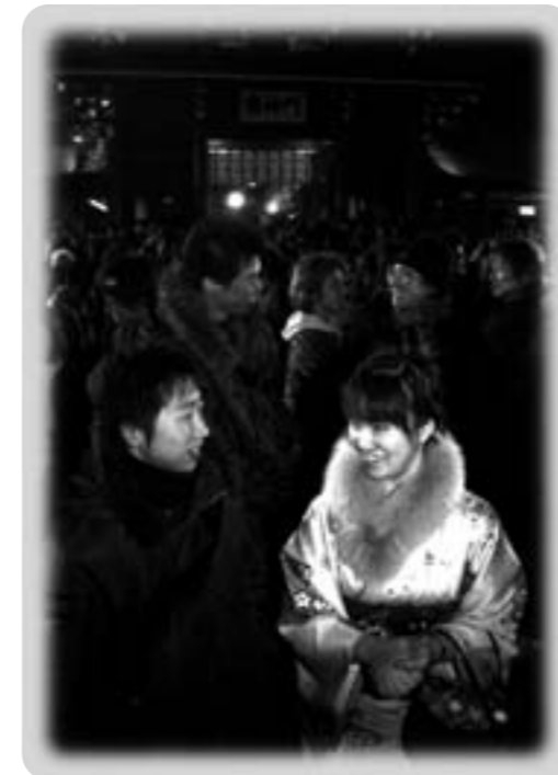
Hatsumode, (first visit to the shrine), at Meiji-jingu Shrine