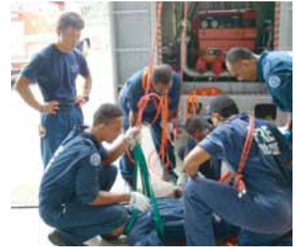
Matsusaka Area Firefighting Association "Water Rescue Training, Fiji"