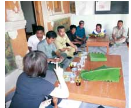
i-i-net "Creation of co-existent and collaborative relationship between local communities and Bali Barat National Park for conservation and management of natural resources and community empowerment, Indonesia"

Expense for JICA Partnership Program is a part of ODA, and JICA entrusts the project to the proposing organization as a part of ODA.