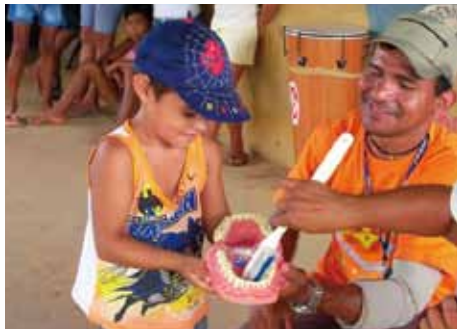
HANDS(Health and Development Service)The Project for Improvement of Children's Health Consciousness by Activating Local Organizations in Western Amazon, Brazil

The aim of this project is to improve community health condition in the Amazon River region through community Health worker's ability improvement, resident's nutritional modification and the hygiene knowledge improvement.