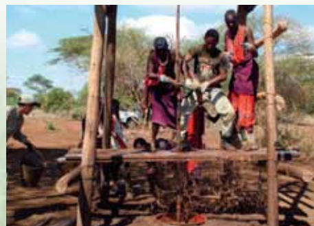
International Water Project (IWP) "Small-scale water supply system in Loitokitok District, Kenya"

IWP is transferring Kazusabori which is traditional Japanese technology of well-digging to local people in Kenya and they construct wells, ponds and trough for livestock in order to access clean and safe water.