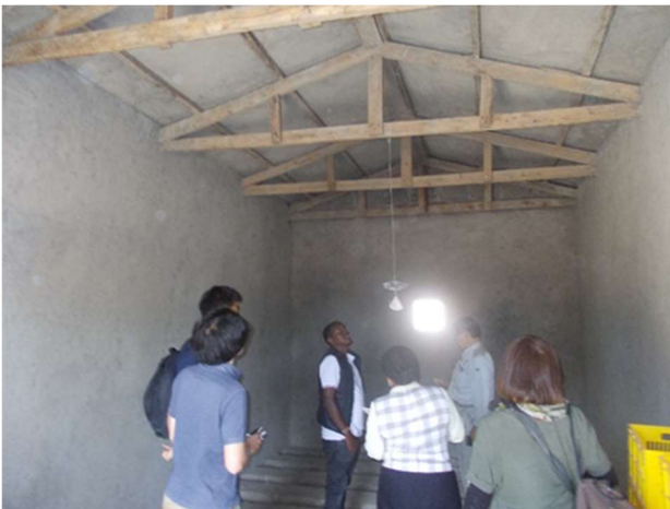
Interior view of Fujita's potato-storage facility (from AFICAT Newsletter No.1 (Kenya)).

Regarding the first topic, a presenter from a private company introduced various technologies, including solar-powered cooling facilities. In the first issue of our newsletter for Kenya, we featured a non-electric potato-cooling and storage facility based on the technology of a Japanese company, Fujita Corporation.