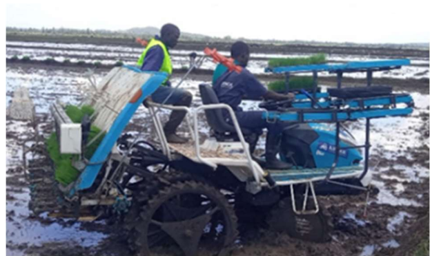
8-row rice transplanter, Kubota NSD8