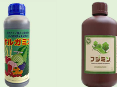
ORGAMIN, foliar fertilizer and FUJIMIN, fulvic acid solution.