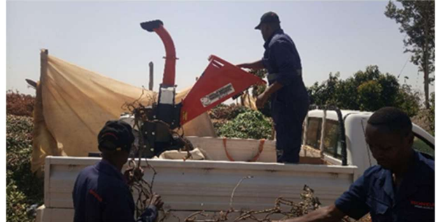
Demonstration of the woodchipper