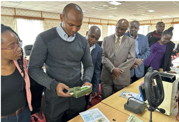
Participants learning how to use Kett's instruments.

During the Q&A session, some of the participants expressed concerns about the durability of the instruments and the availability of spare parts. In response, Kett staff mentioned their ongoing search for local distributors who possess a deep understanding of their instruments, employ well-trained personnel, and provide good after-sales service. The staff emphasized that this practice reflects Kett's commitment to providing maintenance services post-sale. KEBS expressed optimism that Kett's products, already widely recognized in Southeast Asia for their high accuracy, would be used for a variety of grains and beans, including rice, in Kenya.