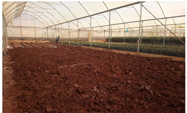
Lauren International Flowers usually undertakes land preparation in greenhouses manually.