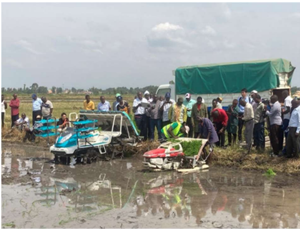
Demonstration of a 6-row riding type rice transplanter (Kubota) and a 4-row motorized walking type rice transplanter (Mitsubishi Mahindra)

accelerate KiliMOL's various activities. The collaboration among stakeholders including KiliMOL, JICA, MoALD, and MIAD is expected to promote the adoption of rice transplanters, thereby contributing to the expansion of rice production in Kenya. The AFICAT team will consistently provide updates on the progress of KiliMOL activities to support the promotion of transplanters and agricultural mechanization in Kenya.