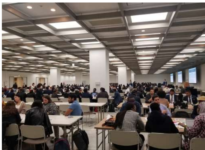
Seminar room was vast enough to accommodate more than 350 participants!