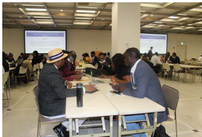
Participants' group discussion sessions.

The next Networking Seminar will be held in December 2023 for those who are scheduled to come to Japan this year.