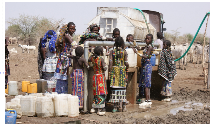
Women and children of nomadic tribe in Blue Nile state gather around water facility

sanitation administration. Targeting the beneficiaries of about 90,000 people, the project aims at facilities rehabilitation in the east and west district of the city.