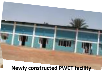
Newly constructed PWCT facility in White Nile State