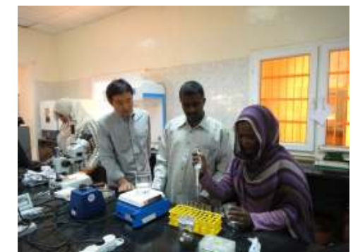
Japanese expert teaching laboratory experiment to Sudanese counterpart (above) Project members in Sorghum field affected by Striga

JICA's Rice-related interventions are supported by a JICA specialist who helped the Ministry to develop National Rice Development Strategy along with other activities.