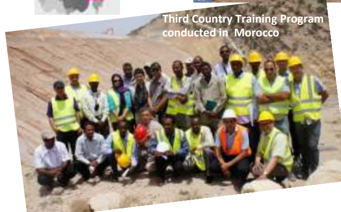
Third Country Training Program conducted in Morocco