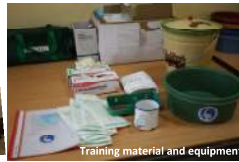
Training material and equipment