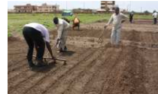
Seeding in the test field located in Gedzila University demonstration farm (above) Rice-cultivation training by separating different species (below)