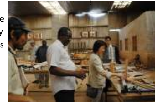
Members of Data Collection Survey on Trade and Investment visited vocational training center in Khartoum City

vulnerability, Sudan remains as a land of opportunity with abundant and diverse natural resources. To put the nation's economy on a recovery path, JICA conducted "Data Collection Survey on Trade and Investment in Sudan" on current situation of Sudan's economic, industrial and trade investment environment with a particular emphasis on non-oil sector from April to August 2012. The survey included capacity assessment in both federal and state level. JICA is expected to present a project plan which will contribute to future economic development in Sudan.