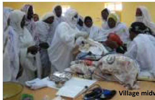
Village midwife in-service training