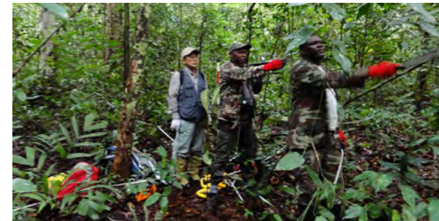
Project for enhancing national forest resources inventory system contributing to sustainable forest management to enhance REDD+ (Gabon)