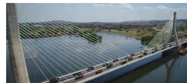
The Source of the Nile Bridge over the Northern Corridor was built with support from Japan (Uganda)

Promote quality infrastructure investment in line with the G20 Principles for Quality Infrastructure Investment with both public and private sectors. In light of coming into force of AfCFTA (the African Continental Free Trade Agreement), develop infrastructure in both "software" and "hardware" aspects to reinforce connectivity among regions in Africa