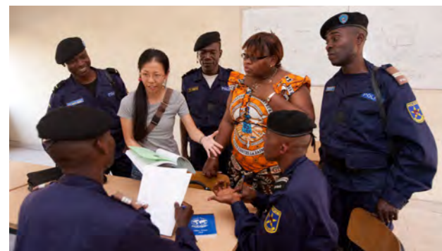
JICA official confirming trainees' leaning level at the venue of National Police Democratization Training (Democratic Republic of the Congo)