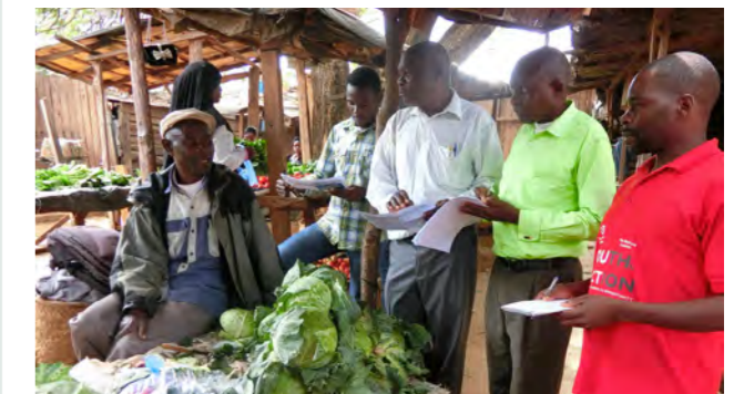
Agricultural extension worker giving hands-on training during SHEP Training Program (Malawi)

※ Resilience, Industrialization, Competitiveness, Empowerment