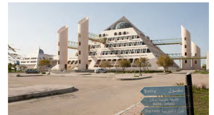
Egypt-Japan University of Science and Technology in suburb of Alexandria