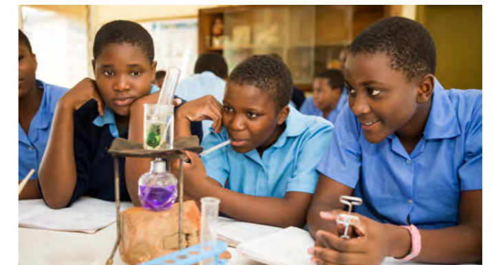
Strengthening of Mathematics and Science in Secondary Education (Malawi)

To promote three pillars of educational development –improvement of education quality, access to education and education management–, further expand cooperation initiatives such as support for science and math education, improvement of scholastic achievement exams, construction of schools and improvement of school management. Promote betterment of educational environment as a foundation for industry development and technology advancement