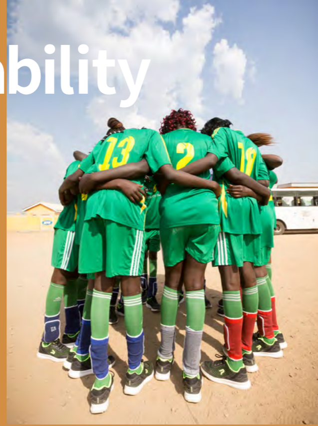
National Sports Competition was held to enhance peace through sport on the National Unity Day