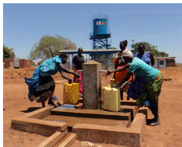
Public water source installed through the Project for Provision of Improved Water Source for Resettled Internally Displaced Persons in Acholi Sub-Region (Uganda)

With the humanitarian-development nexus in mind, provide assistance to achieve self-reliance, partnering with emergency/humanitarian actions conducted by international organizations. Support refugees' and IDPs' host communities. Prevent radicalization of youths through creation of job opportunities for youths