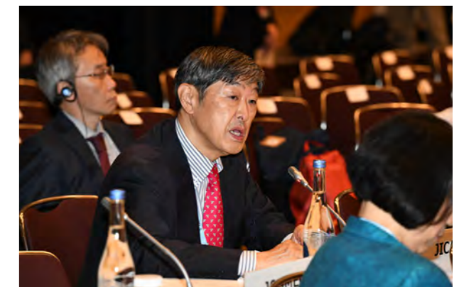
From JICA, President Kitaoka and other officials attended the conference. JICA also held 78 bilateral talks (including those with 22 African leaders and over 9 heads of international organization), 31 side events, while signing over 9 memorandums and conducting many PR events such as 'Bon for Africa'.