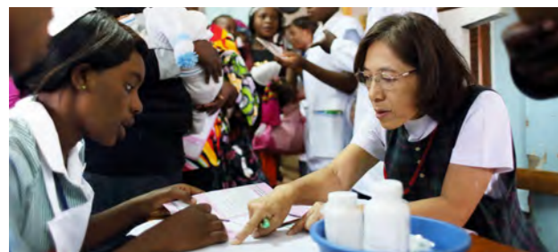
JICA volunteer giving guidance for newborn/infant health examinations and apprenticeships at Maternal and Child Health Center (Zambia)

In order to advance UHC, reinforce healthcare human resource development, healthcare service system and financial base through financial and technical assistance, giving particular consideration for maternal and child health, reproductive health and communicable/non communicable diseases