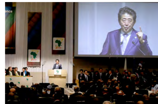
Prime Minister Abe announced that the Japanese government would do its best to further increase private investment toward Africa that had reached approximately USD 20 billion in the past three years. Enterprises also showed their commitment to actively promote their African business.