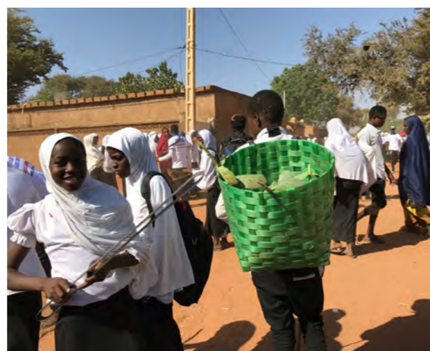
Cleaning campaign was conducted at a middle school in the capital city to create a 'Clean City' (Niger)

Develop infrastructure from both "hardware" and "software" aspects focusing on waste management, water supply/wastewater facilities and urban development targeting at African cities that are rapidly urbanizing, in order to contribute to sustainable urban development