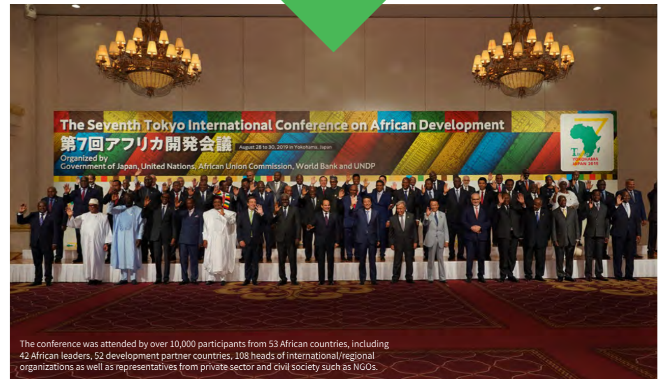
The conference was attended by over 10,000 participants from 53 African countries, including 42 African leaders, 52 development partner countries, 108 heads of international/regional organizations as well as representatives from private sector and civil society such as NGOs.