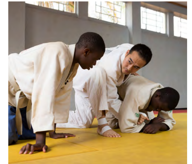
JOCV volunteer instructing Judo at a sport center in the capital city (Malawi)

Provide sports instruction and guidance to disseminate sports for women and people with disability in African countries. Contribute to peace and stability through sports. Conduct matching and follow-ups with Tokyo Olympics/Paralympics host towns