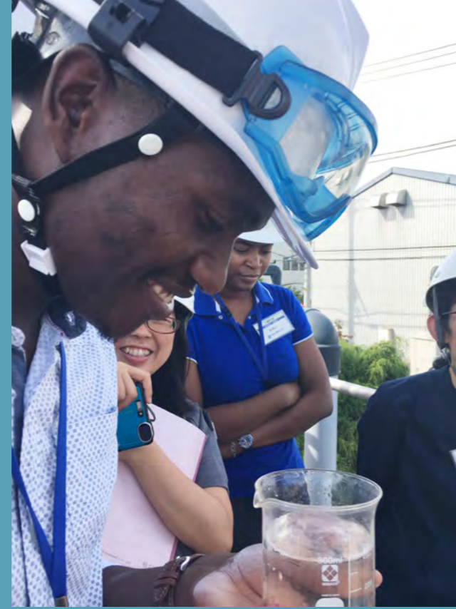
ABE Initiative trainee working as an intern at a firm in Yokohama City

Accelerating economic transformation and improving business environment through innovation and private sector engagement