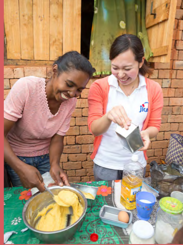
JOCV volunteer working to correct unbalanced diet (Madagascar)