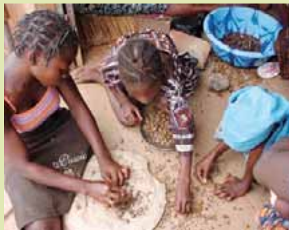
Group members extracting palm oil

management was held for members who were just beginning group activities and who were completely illiterate. Members were divided into four groups and held discussions based on three case studies. Through a participation-type method of sharing discussion results at the conclusion session, they learned the significance of group activities and the basics of group management. They are also working to strengthen networks between the group and public organizations in the community such as welfare centers and city offices. (Benin JICA Representative Office)