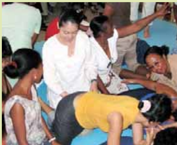
Birth attendants in Boeny Region participating in childbirth assistance training. Together they consider what constitutes safe and comforting assistance.