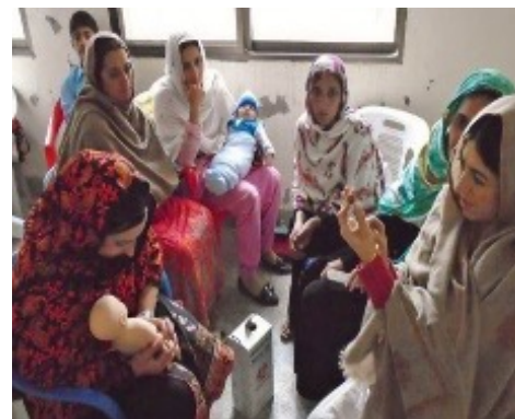
Lady Health Worker training