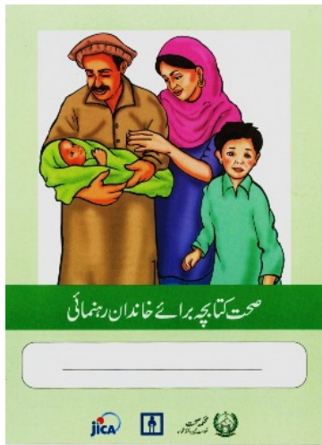
Family Health Book in KP & Punjab