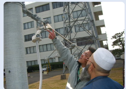
The training programme by JICA helps transfer of Japanese experience to officials of Pakistan

By inviting officials from developing countries, The knowledge Co-Creation Program (KCCP) provides technical knowledge and practical solutions for development issues in participating countries