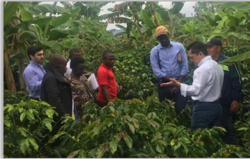
A Colombian farmers explaining to some members of Rwandan delegation good agriculture practices including banana coffee intercropping.

JICA Rwanda through Coffee Upgrade and Promotion Project (CUP) has been aligning the National Agriculture Export Board (NAEB) vision through strengthening coffee value chain to become competitive in international market. It is in this framework that among other project components, CUP has been organizing coffee study tours to provide an opportunity to key stakeholders to learn from advanced countries.