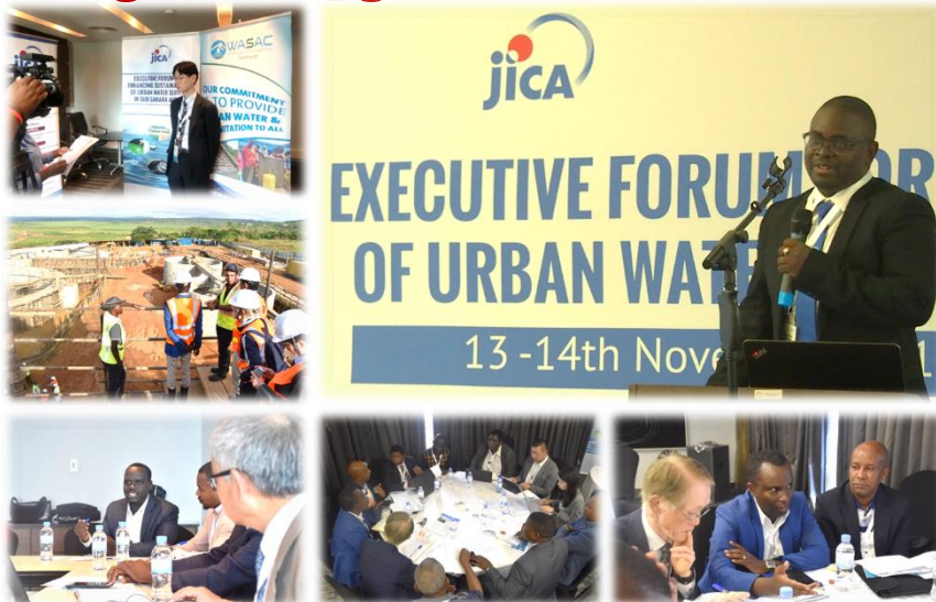
Photos of Regional Executive Forum on Urban Water Supply in the City Of Kigali

From 13 to 14 November, 2019 in Kigali City, “Regional Executive Forum on Urban Water Supply” was held by the Japan International Cooperation Agency (JICA) in partnership with Water and Sanitation Corporation Limited (WASAC).