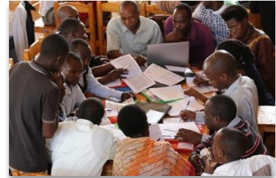
Education Officials discussing lesson Study during a lesson preparation session

crucial two support teachers in their effort at delivering quality lessons. ●