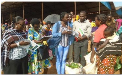
RAB officers practicing market survey training as the first and important step in the market oriented agriculture approach disseminated by SMAP project Ntunga Market Rwamagana District.

September 19, 2019, the Smallholder Market Oriented Agriculture (SMAP)