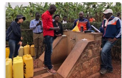
A private operator technician trained by RWASOM project making a demonstration of water quality test to JICA officials and local resident.

national guidelines and manuals for sustainable rural water supply management. In addition, the project provided several trainings to district support engineers and private operators, and enhanced the knowledge and capacity of key partners on managing the water supply facilities at the ground. For monitoring and preventive planning terms, the project developed a mapping tool of Geographic Information System for rural water supply systems where all water facilities were mapped. ●