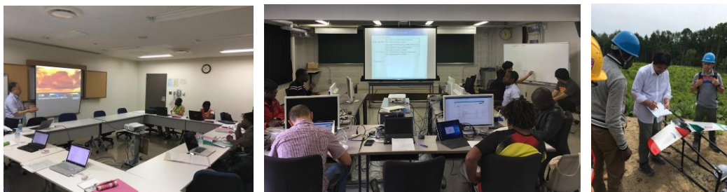
Pictures of previous course: left: lecture of Climate change etc. center: Technical training of remote sensing, right: Drone operation at a test field

The inception report presentation will be held at the beginning of this course.