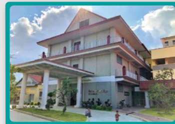
Battambang Province Hospital