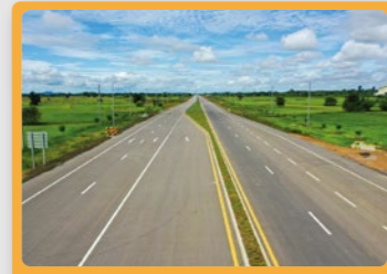
National Road No.5