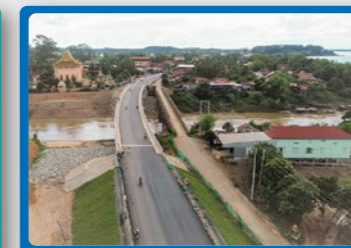
Urgent Replacement of Bridges in Flood-Prone Areas