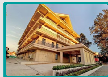
Siem Reap Province Hospital

In addition to these listed projects, other types of assistance are provided, which include Grant Aid for Grassroots Human Security Projects, Grant Aid through International Organizations and Dispatch of Experts / Volunteers. *ODA = Official Development Assistance