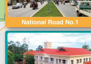
Svay Rieng Province Hospital