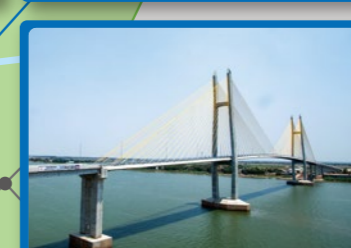
Neak Loeung Bridge (Tsubasa Bridge)