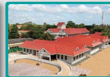
Kampong Cham Province Referral Hospital