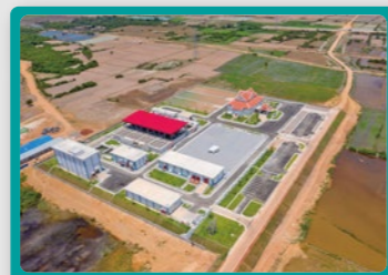
Siem Reap Water Treatment Facilities