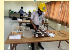
Activities of practical final examination

JICA's Impact on Technical and Vocational Education and Training in Cambodia