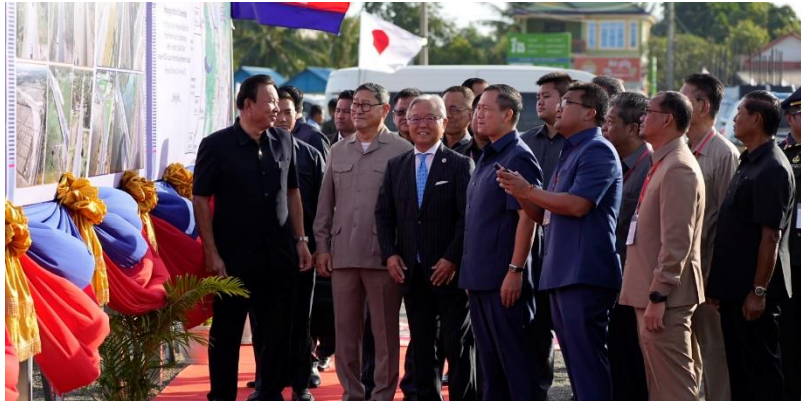
Inauguration ceremony of National Road No. 5

The National Road No. 5, a route connecting Phnom Penh and Thailand, is widely known as Asian Highway No.1 and a part of the Southern Economic Corridor. With the steady economic growth of the country, the role of National Road No.5 has been increasingly crucial both in transportation and logistics.