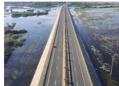
National Road No.5 Improvement Project

Cambodia has frequently experienced with flooding across the country, particularly in flood-prone areas where houses, schools, agricultural land, and roads have been inundated. Another achievement of National Road No.5 enables people to travel without the further concern of being stuck during period of heavy rainfall and flood season.