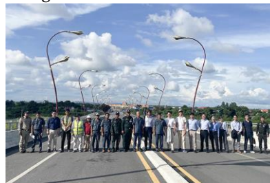
Border officials at the new Stung Bot border between Cambodia and Thailand.

Bangkok, Thailand, exploring the current state of connectivity and the challenges that must be addressed to strengthen it. ●