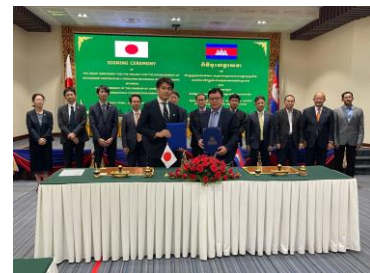
Signing ceremony

achievement of SDGs Goals 9 (Industry, innovation and infrastructure) and 11 (Sustainable cities and communities). ●