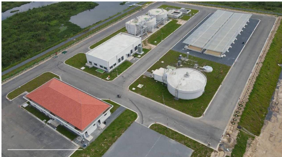
Cheung Aek Sewage Treatment Plant

Challenging Sanitation Improvement through Sustainable Wastewater and Sewerage Management in Cambodia